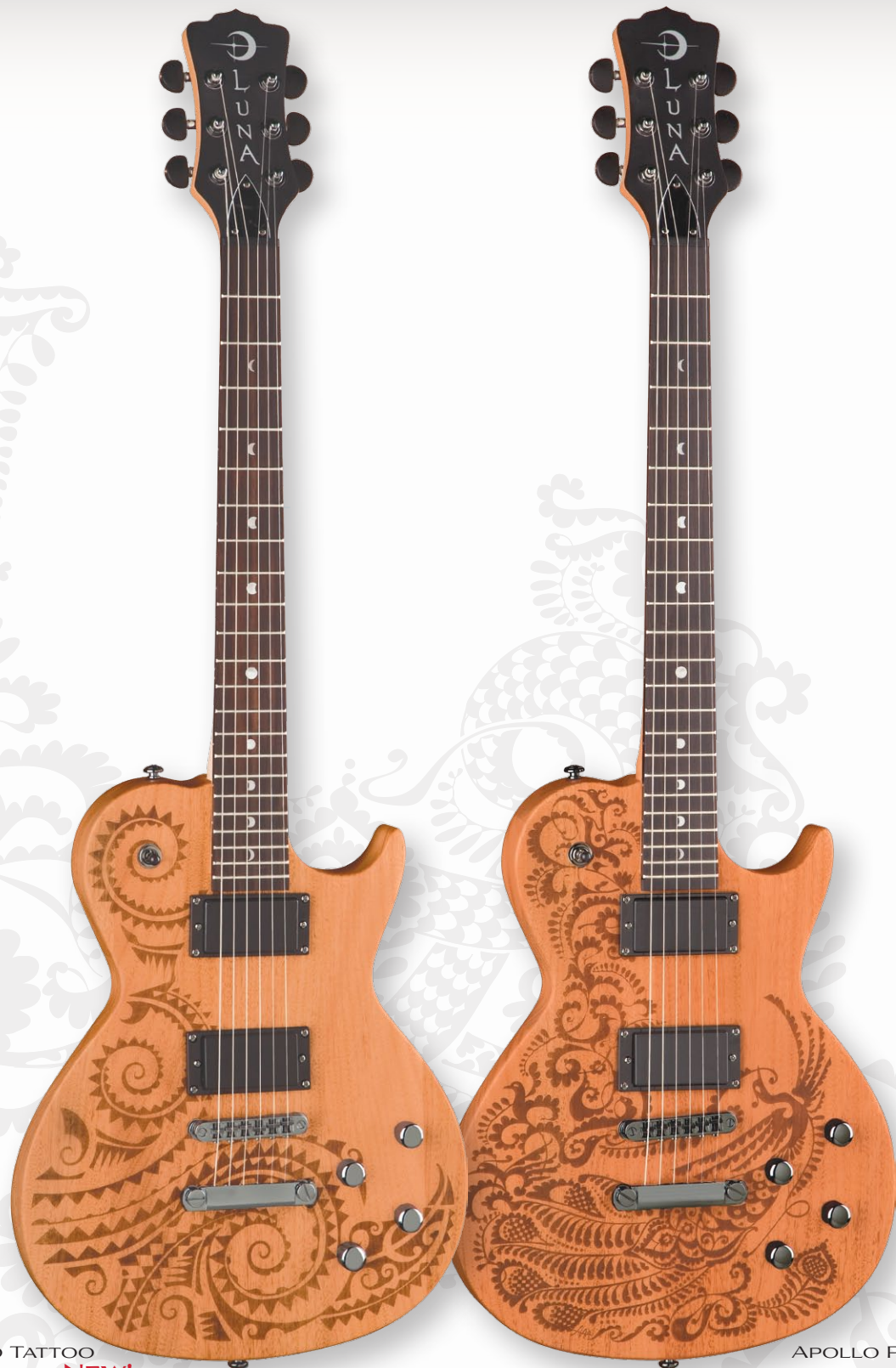
APOLLO TATTOO NEW!