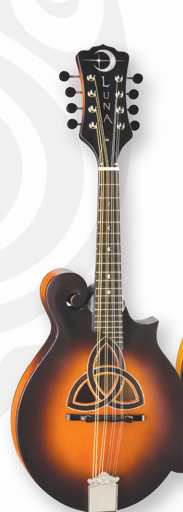
TRINITY F MANDOLIN