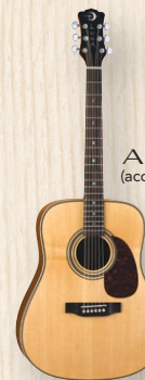
AMD 50 (acoustic only)