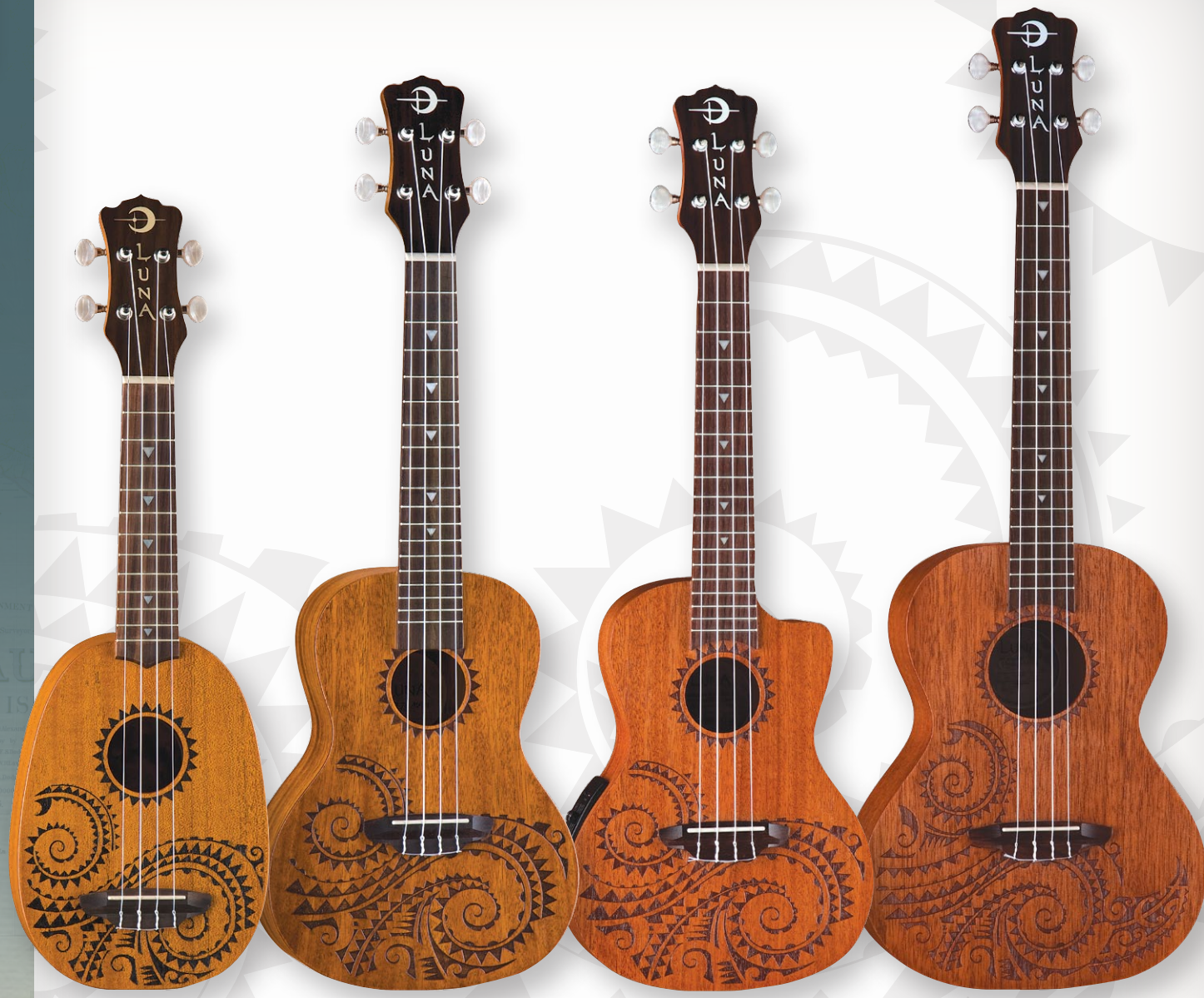
TATTOO SOPRANO TATTOO CONCERT TATTOO CONCERT ELECTRIC TATTOO TENOR

"When you lost sight of your path, listen for the destination in your heart." - Katsura Hoshino