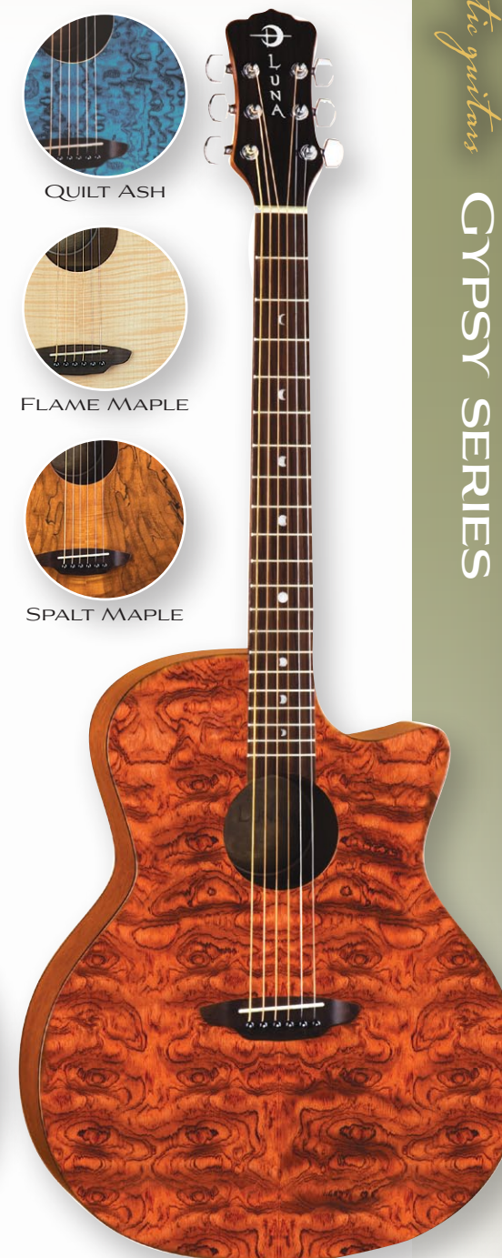
GYPSY EXOTIC BUBINGA

EXOTIC WOOD GRAPHICS BODY: grand concert TOP: select spruce BACK & SIDES: mahogany NECK: mahogany SCALE: 25 1/2" NUT: 1 11/16" FINISH: gloss