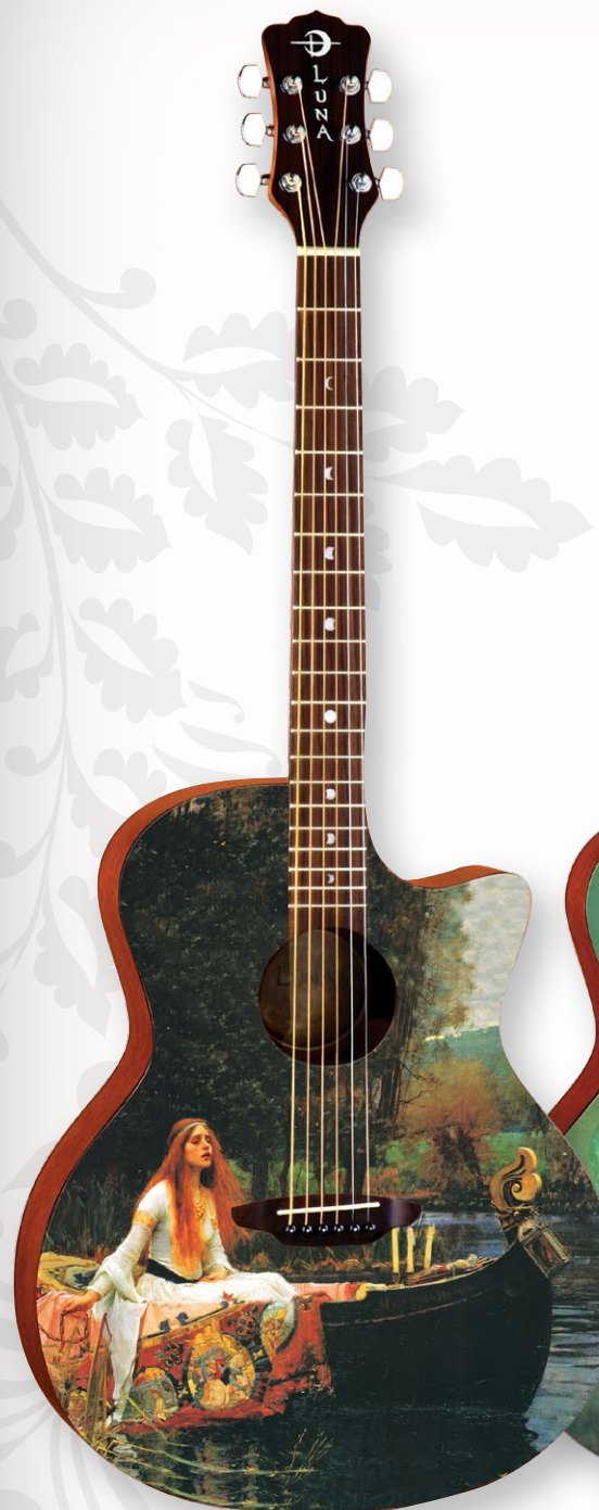
GYPSY FANTASIE "LADY OF SHALLOT"