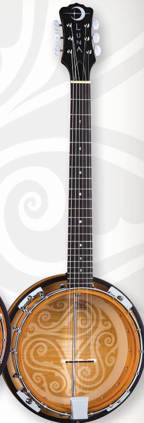
6-STRING TRINITY BANJO