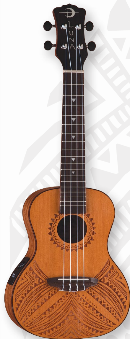
SOLID CEDAR TAPA CONCERT