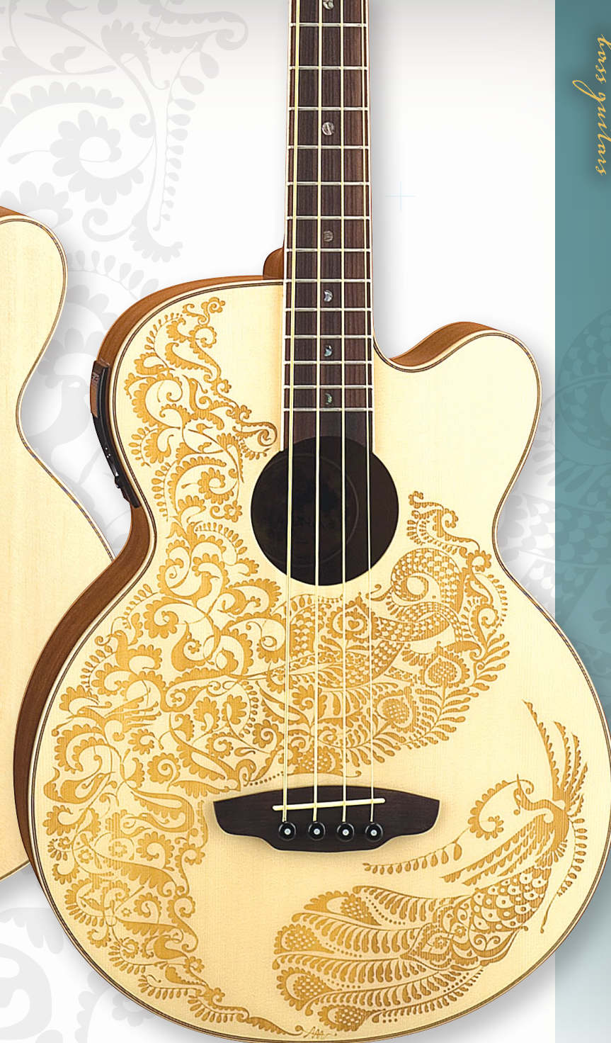
HENNA PARADISE BASS

"Gold fast to dreams, for if dreams die, life is a broken-winged bird that cannot fly." - Langston Hughes