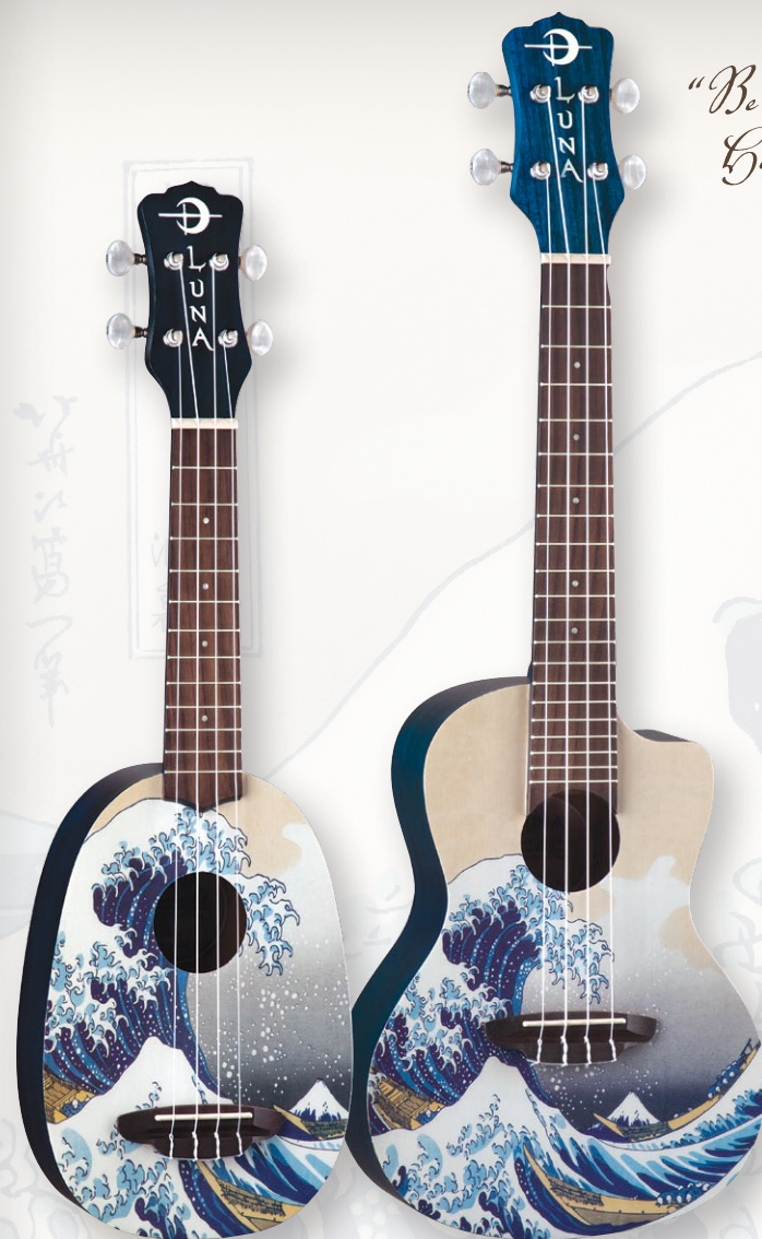
GREAT WAVE SOPRANO