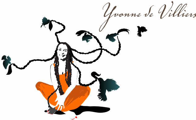
tribal elder, muse, and the creative vision behind Luna Guitars

Your one precious life is yours alone. Pay attention to your fire, to your ache, to your most courageous heart.