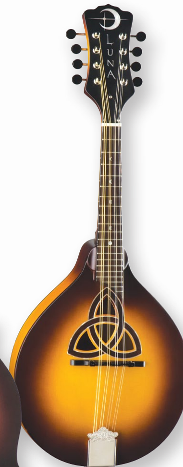
TRINITY A MANDOLIN