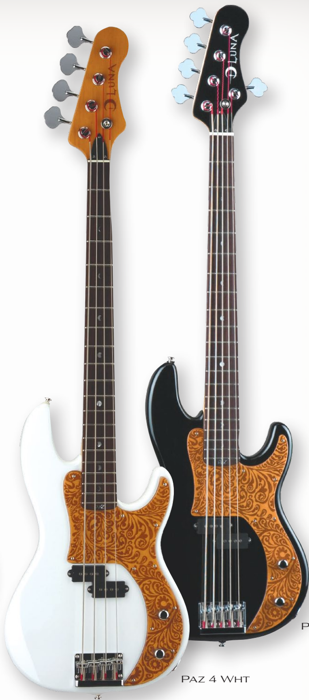
PAZ 4 WHT