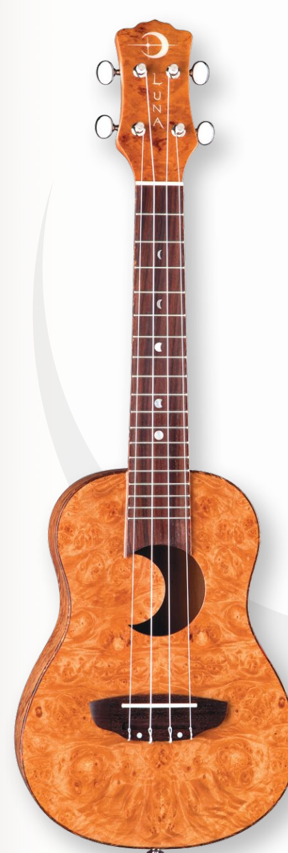
MAPLE BURL NEW!

"Nature never repeats herself, and the possibilities of one human soul will never be found in another." - Elizabeth Cady Stanton