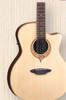
FOLK NYLON NEW!