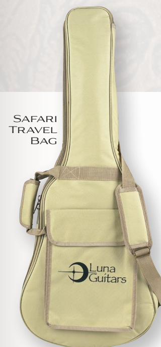
SAFARI TRAVEL BAG

"One person with passion is better than forty people merely interested." - E.M. Forster