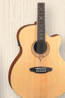
GRAND CONCERT TWELVE NEW!