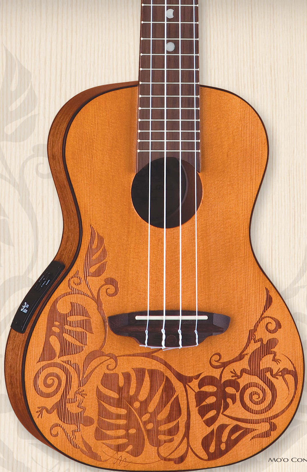
MO'O CONCERT CEDAR

"What am I living for and what am I dying for are the same question." - Margaret Atwood