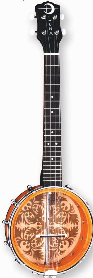
ULU 8" CONCERT