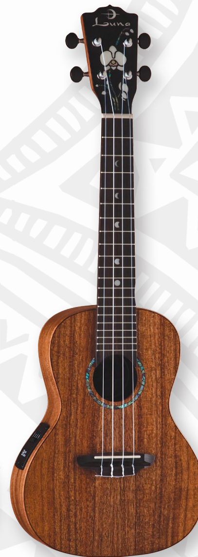
ALL SOLID MAHOGANY ORCHID CONCERT