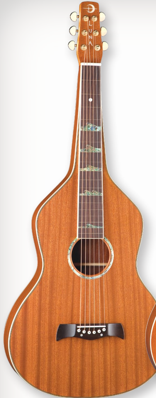
WEISSENBORN-STYLE SOLID NEW!