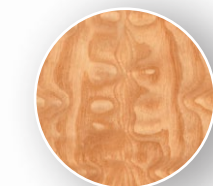
ALSO AVAILABLE IN QUILT ASH NEW!