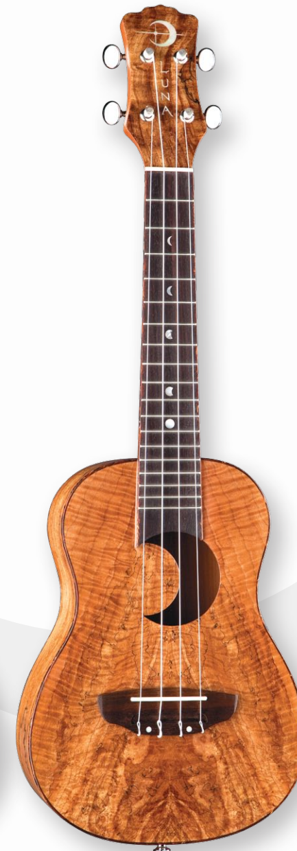
SPALT MAPLE NEW!