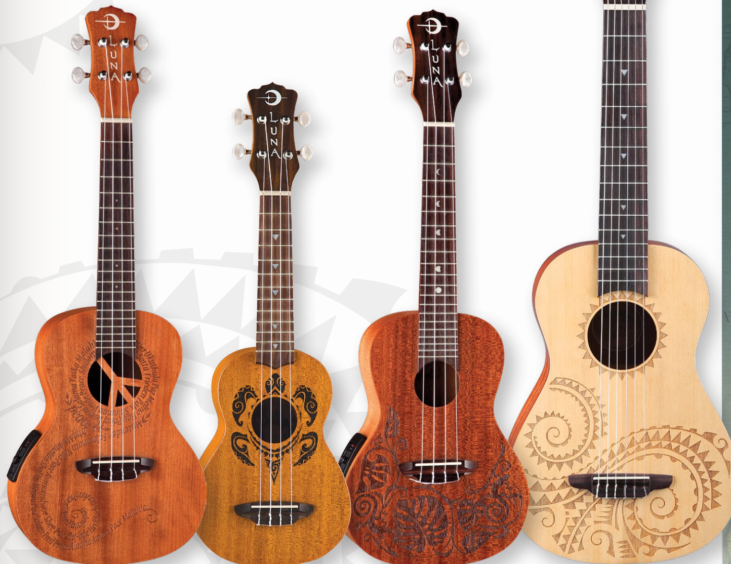
MALUHIA CONCERT NEW ELECTRIC! HONU SOPRANO MO'O CONCERT NEW ELECTRIC! TATTOO 6 BARITONE NEW!