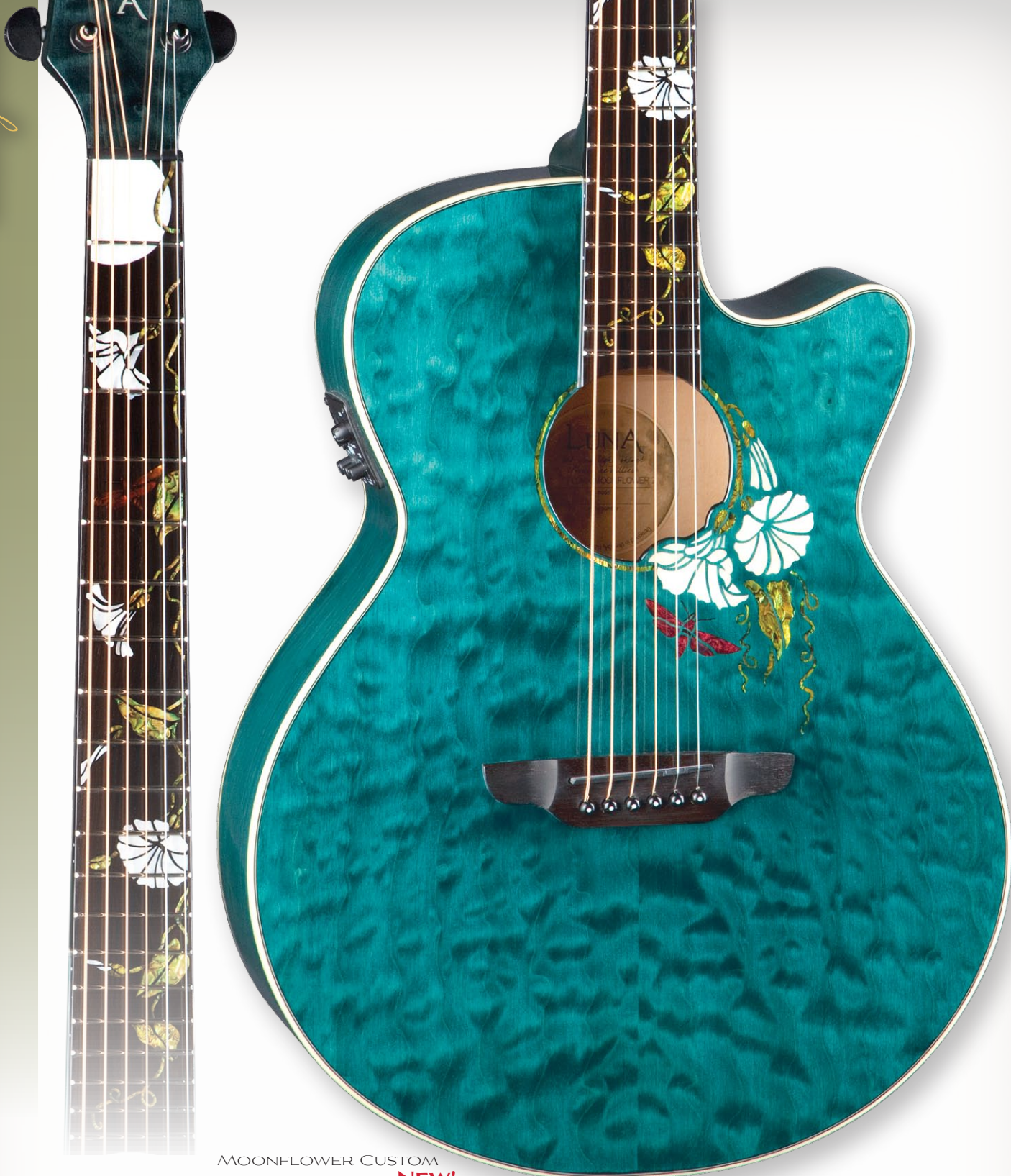
MOONFLOWER CUSTOM NEW!

"Nothing is impossible - the word says 'I'm possible'!" - Audrey Hepburn