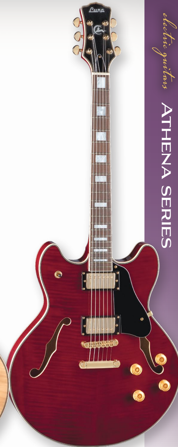
ATHENA 501 RED

"Don't bend; don't water it down; don't try to make it logical; don't edit your own soul. Rather, follow your most intense obsessions mercilessly." - Franz Kafka