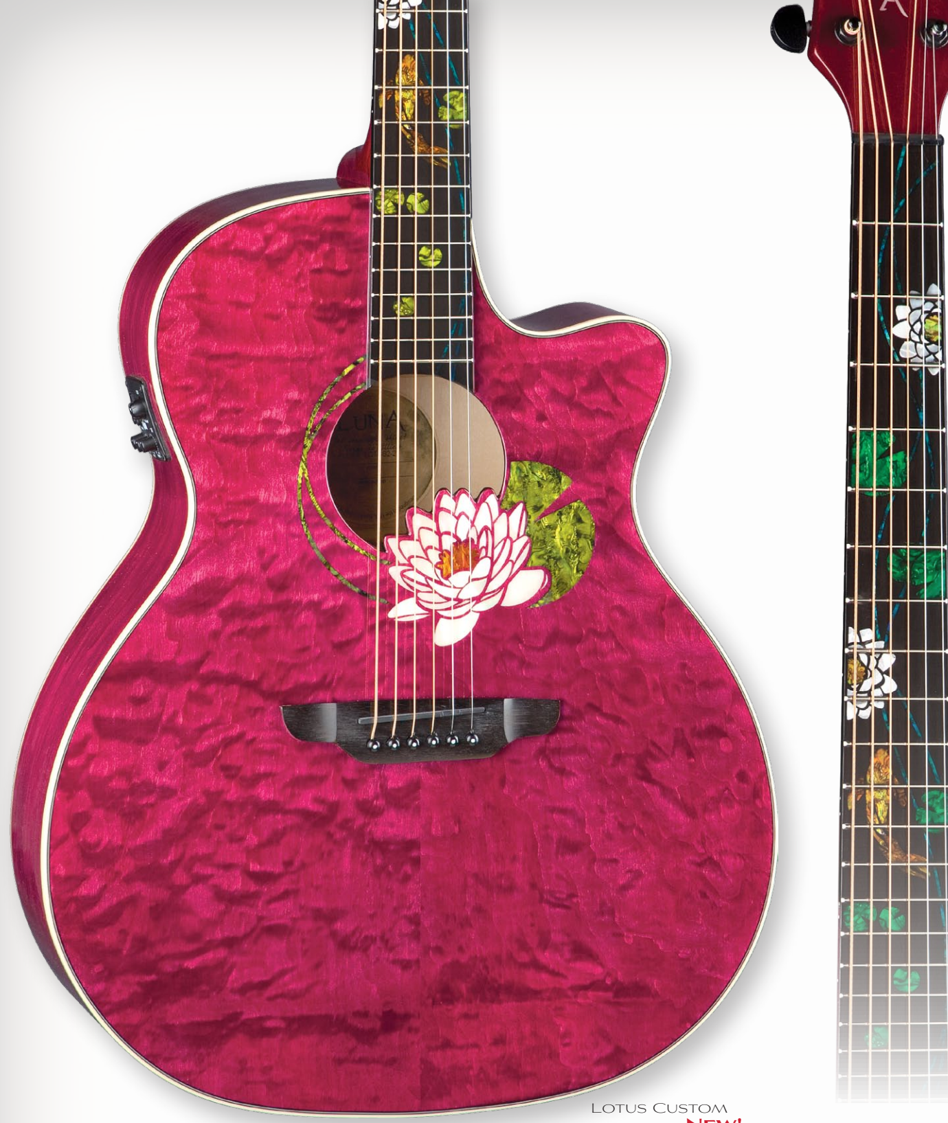
LOTUS CUSTOM NEW!

Moonflowers are revered throughout many cultures as a medicinal or sacred visionary plant. Because they only bloom at night, they are a metaphor for the fact that out of the darkness comes creative blossoming.