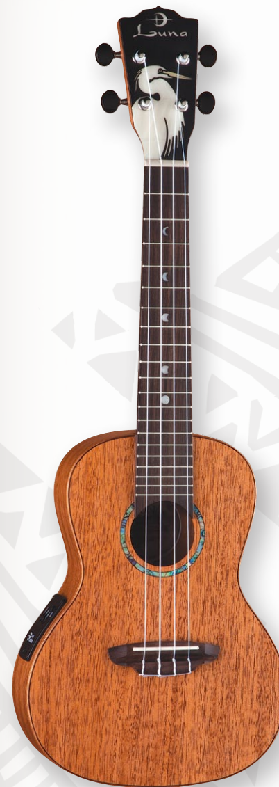
ALL SOLID KOA EGRET CONCERT