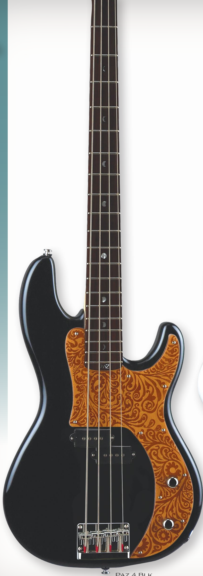
PAZ 4 BLK