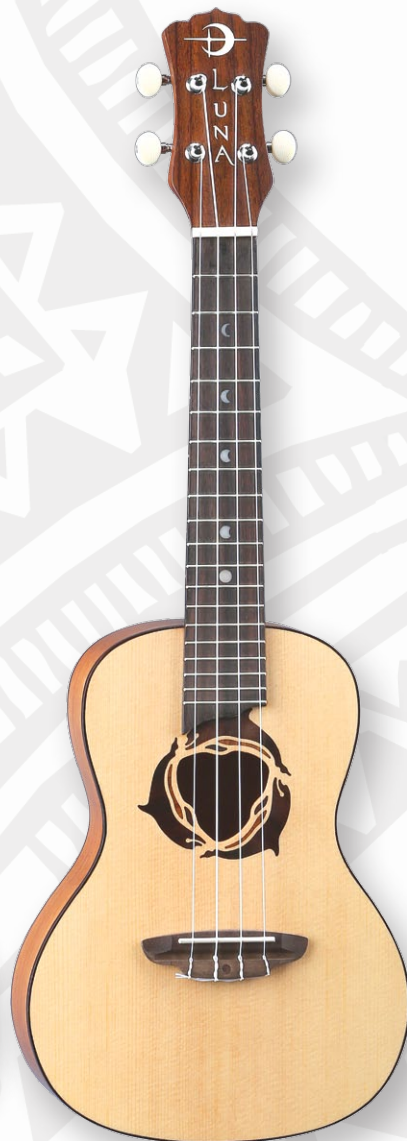
SOLID SPRUCE DOLPHIN CONCERT NEW!