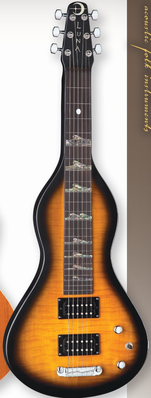
ELECTRIC LAP STEEL NEW!

"Great spirits have always encountered opposition from mediocre minds." - Albert Einstein