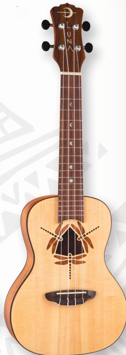
SOLID SPRUCE DRAGONFLY CONCERT NEW!