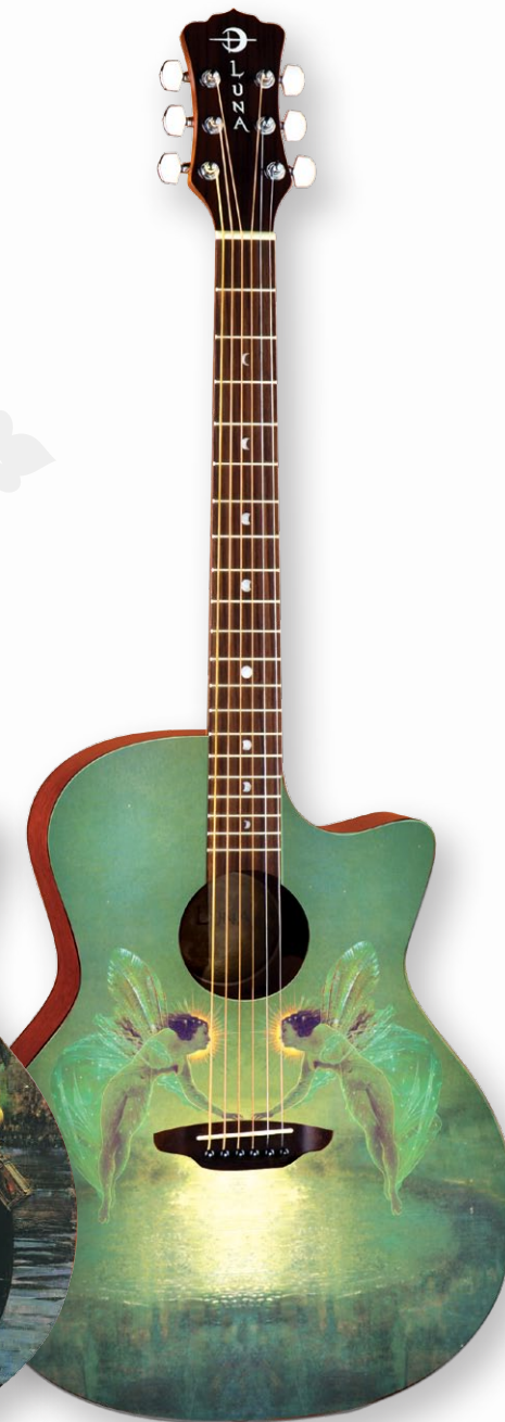
GYPSY FANTASIE "SPIRIT OF THE NIGHT"

"It is never too late to be what you might have been." - George Elliot