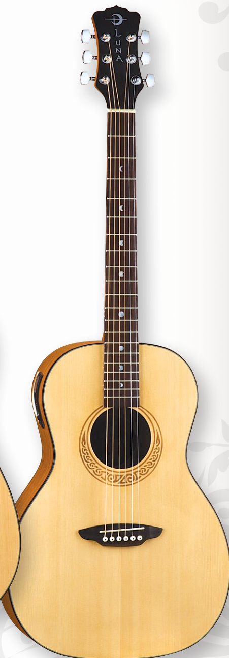
GYPSY MUSE PARLOR

"Four very powerful words to say to your child: 'I believe in you.'" - Kevin Heath