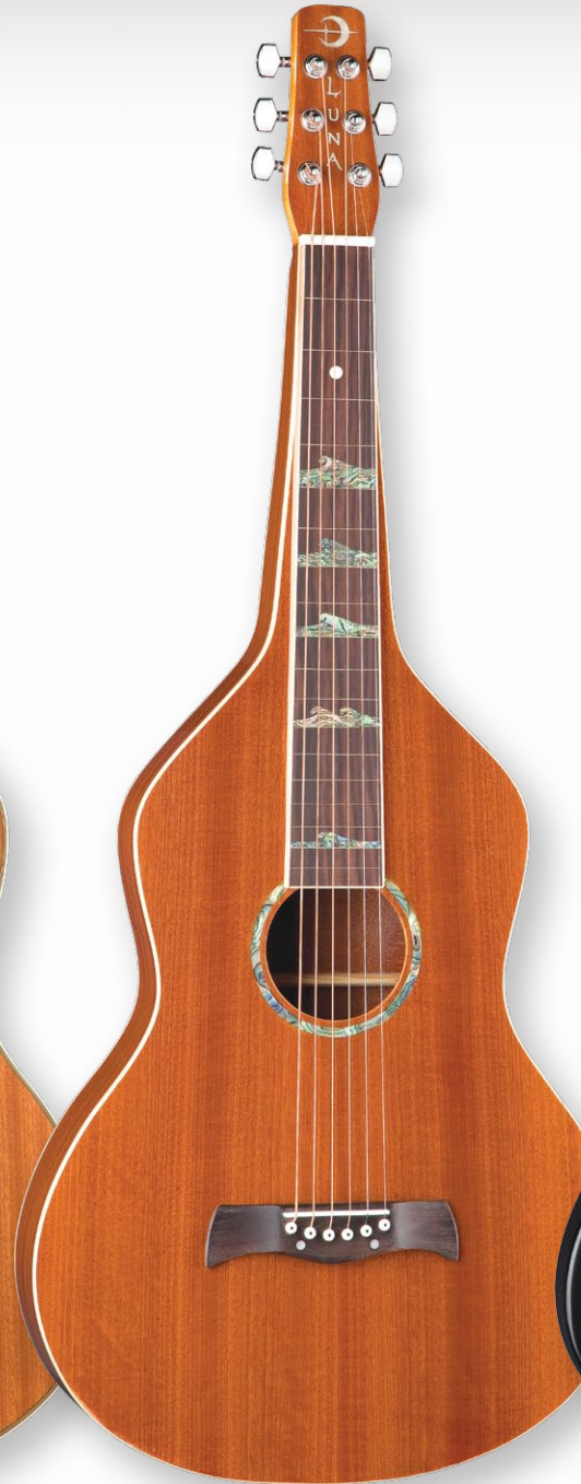
WEISSENBORN-STYLE SELECT NEW!