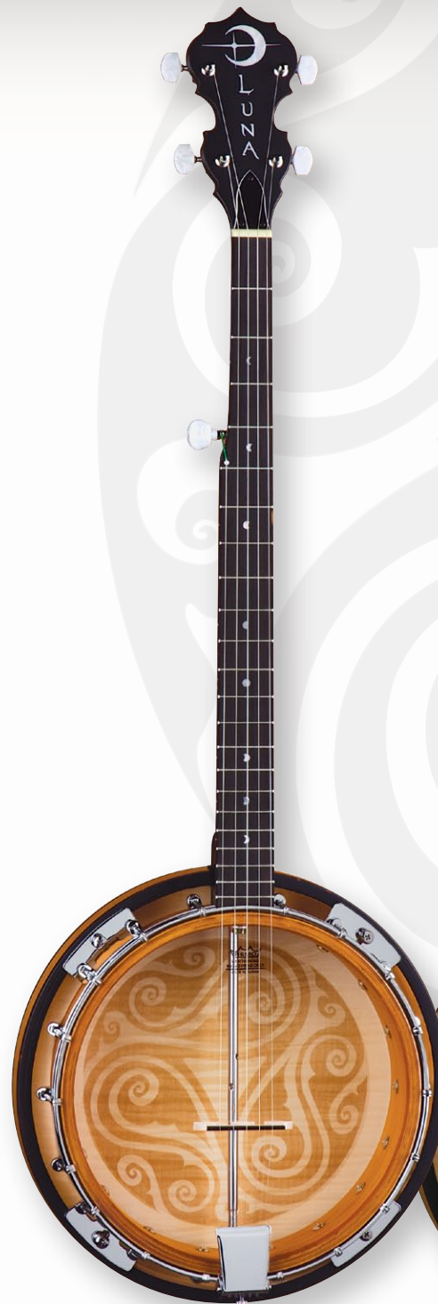
5-STRING TRINITY BANJO

Luna's banjos feature the same exquisite detailing as our other instruments. The back of the mahogany resonator makes a perfect canvas for the Celtic-inspired "Trinity" laser etched design, over a beautiful tobacco burst with faux tortoise shell binding – making these instruments truly unique.