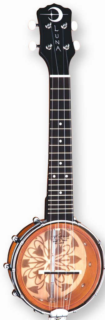
KALA 6" SOPRANO

"Following all the rules leaves a completed checklist. Following your heart achieves a completed you." - Ray Davis