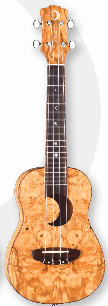
OLIVE ASH BURL NEW!

Introducing Luna's Exotic series ukes! These three tropical wood jewels invoke balmy tropical nights, with a crescent moon shape sound hole, and Luna's signature moon phase fret markers in mother-of-pearl. Take your pick of three beautiful offerings... olive ash burl, maple burl, or spalt maple.