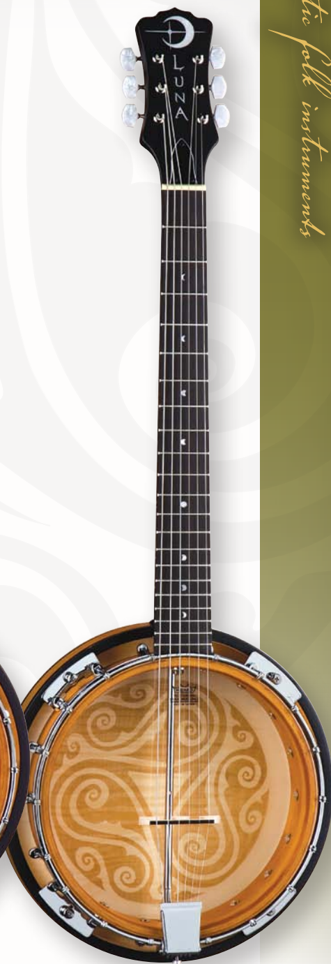
6-STRING TRINITY BANJO