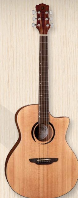
WABI SABI GC CUTAWAY NEW!