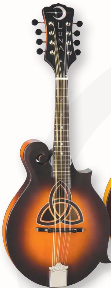
TRINITY F MANDOLIN