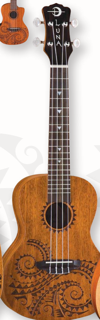
TATTOO CONCERT ELECTRIC VERSION PERFECT WITH OUR UKE SUITCASE AMP!