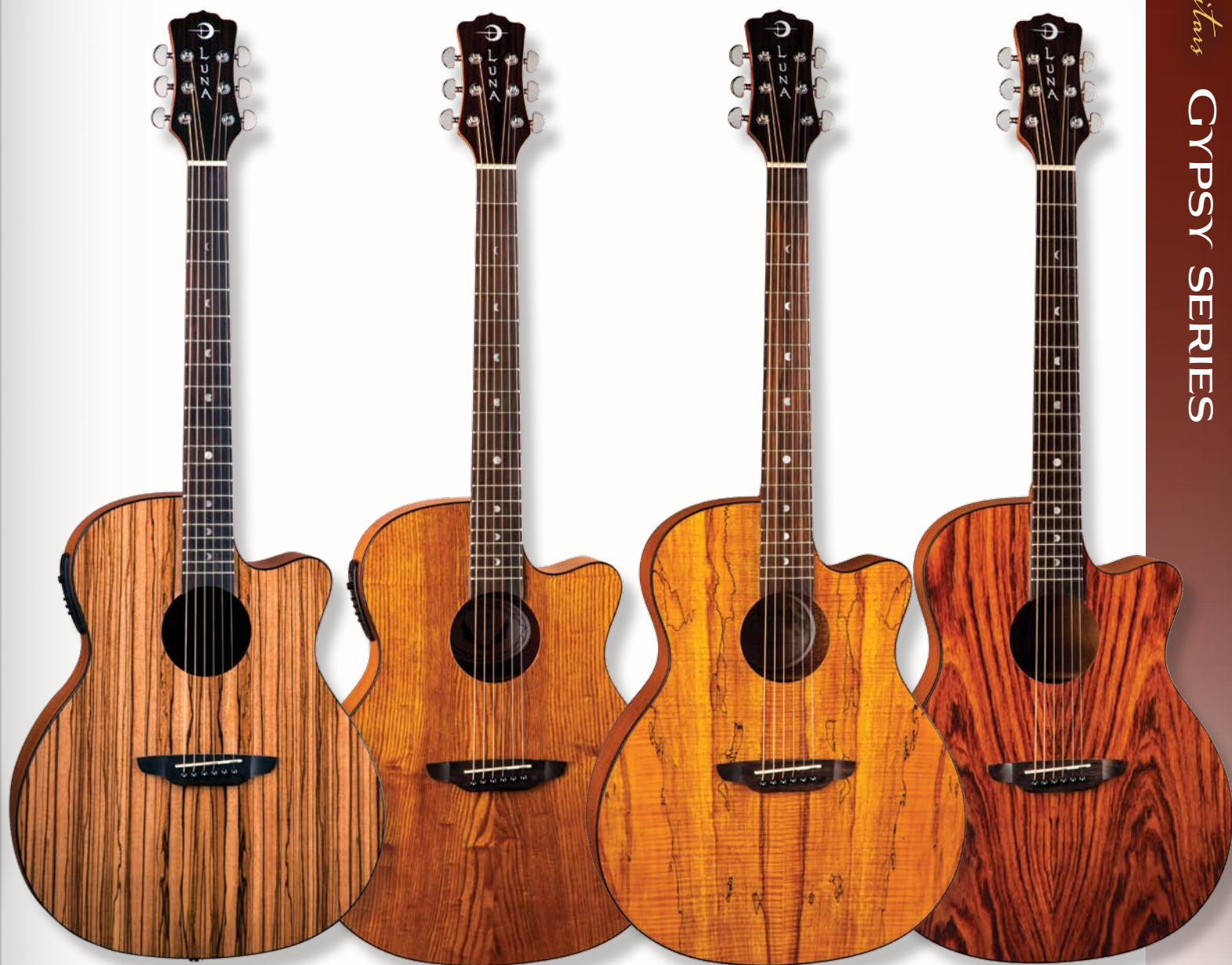
GYPSY ZEBRA NEW!