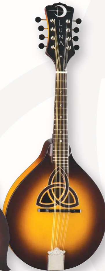
TRINITY A MANDOLIN

"Don't turn away. Keep your gaze on the bandaged place. That's where the light enters you."