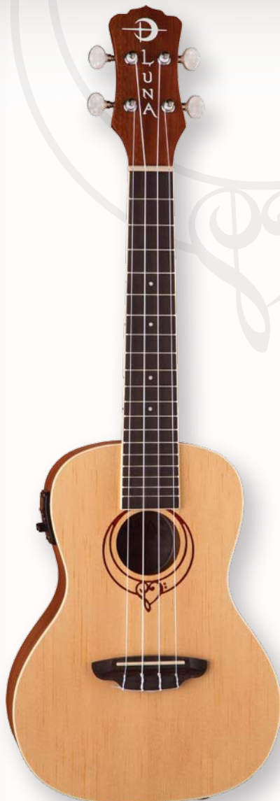
HEARTSONG UKE USB-EQUIPPED FOR RECORDING ON THE FLY!