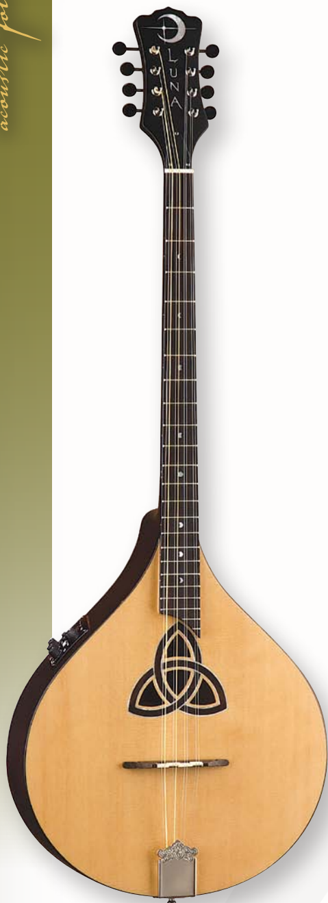
TRINITY ELECTRIC BOUZOUKI