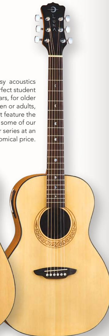
GYPSY MUSE PARLOR

Our Gypsy acoustics are perfect student guitars, for older children or adults, that feature the look of some of our regular series at an economical price.