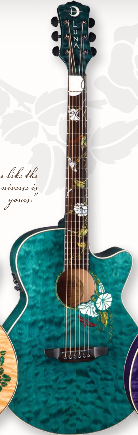
FLORA MOON FLOWER