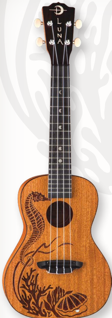
ALL SOLID MAHOGANY PEARL CONCERT

"Be melting snow. Wash yourself of yourself".