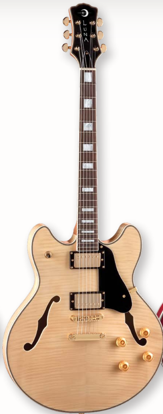
ATHENA 501 NATURAL