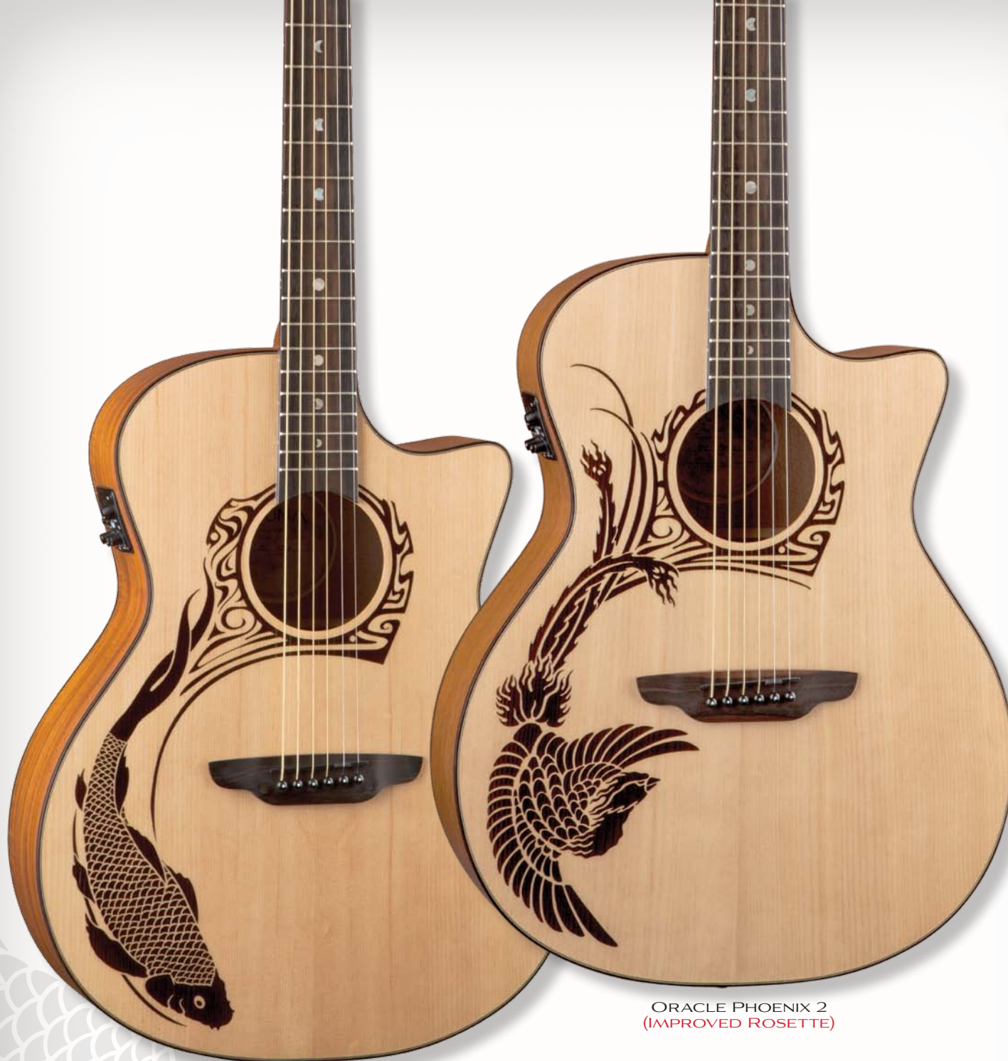
ORACLE KOI 2 (IMPROVED ROSETTE)