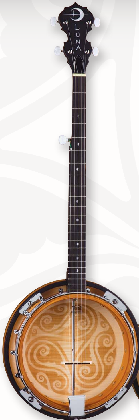
5-STRING TRINITY BANJO

Luna's banjos feature the same exquisite detailing as our other instruments. The back of the mahogany resonator makes a perfect canvas for the Celtic-inspired "Trinity" laser etched design, over a beautiful tobacco burst with faux tortoise shell binding – making these instruments truly unique.