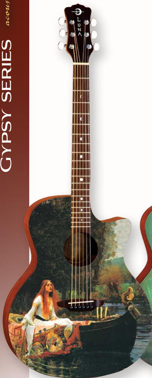
GYPSY FANTASIE "LADY OF SHALLOT"