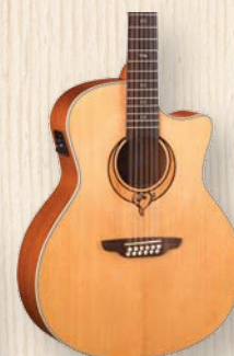
GRAND CONCERT TWELVE