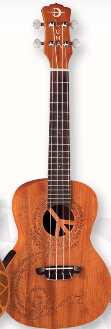
MALUHIA CONCERT PERFECT WITH OUR UKE SUITCASE AMP!