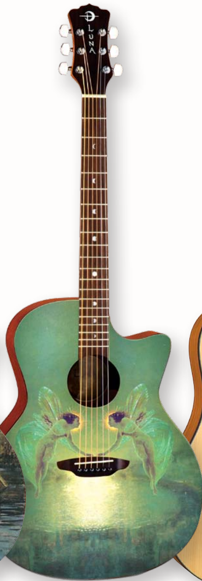
GYPSY FANTASIE "SPIRIT OF THE NIGHT"