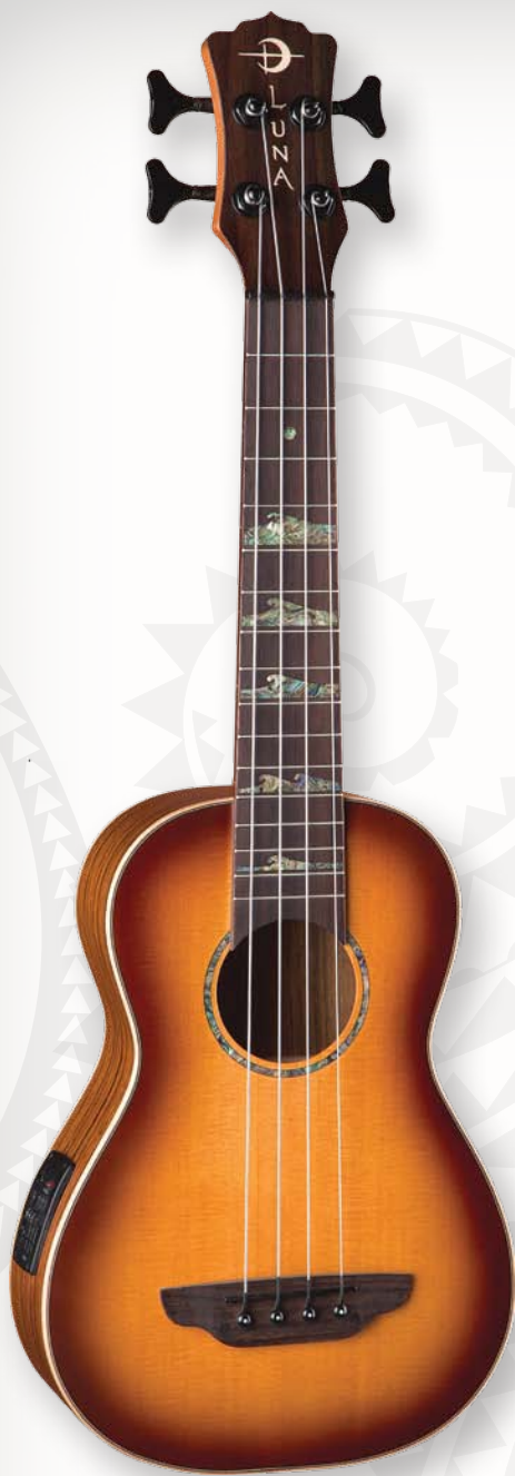
HIGH TIDE UKE BASS