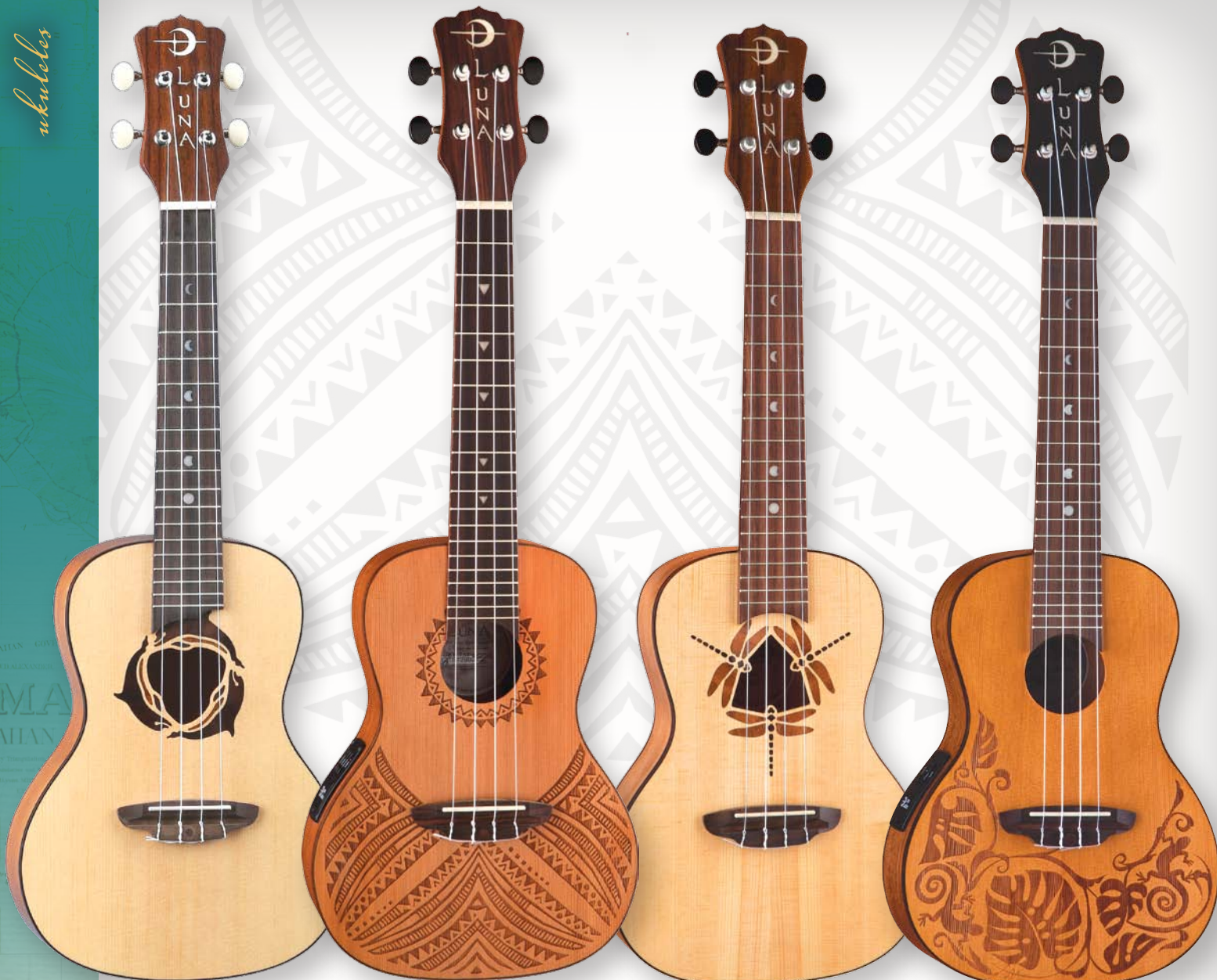
SOLID SPRUCE DOLPHIN CONCERT