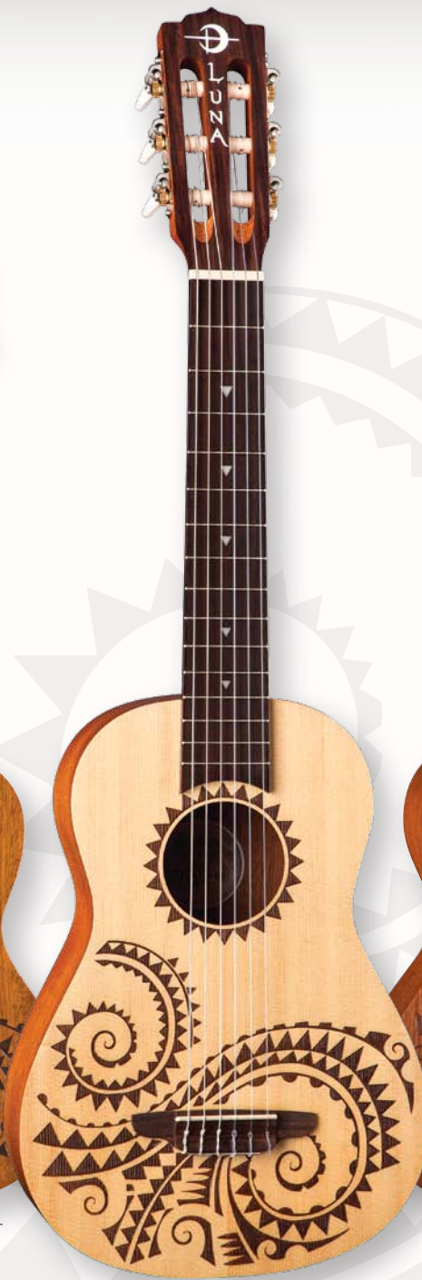
TATTOO 6 BARITONE