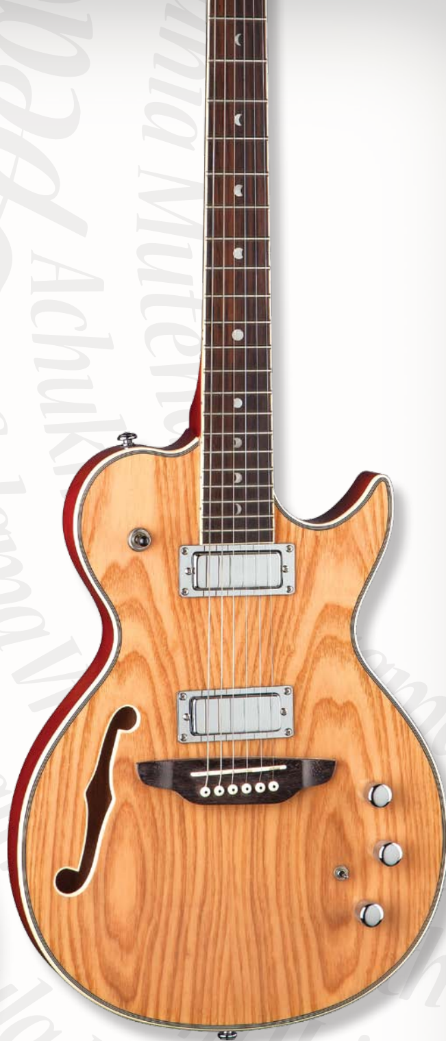
ATHENA HYBRID QUILTED ASH

"Maybe you are searching among the branches for what only appears in the roots"