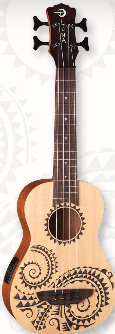
TATTOO UKE BASS