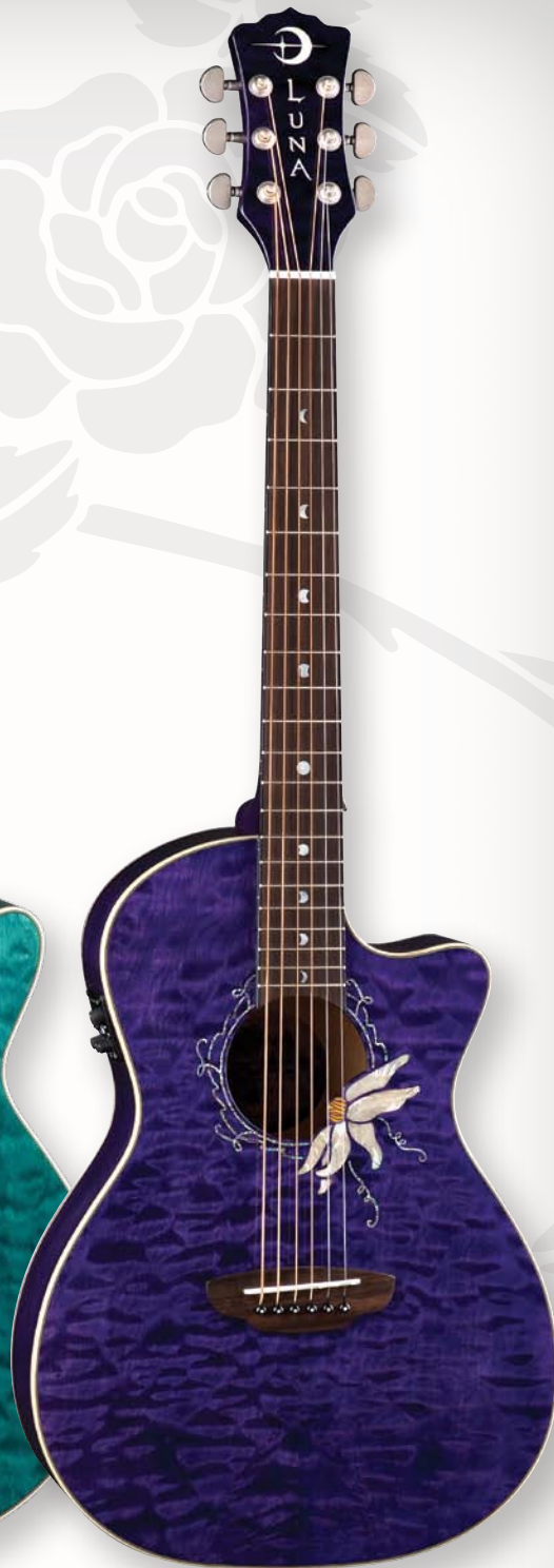
FLORA PASSION FLOWER

"Shine like the whole universe is yours."