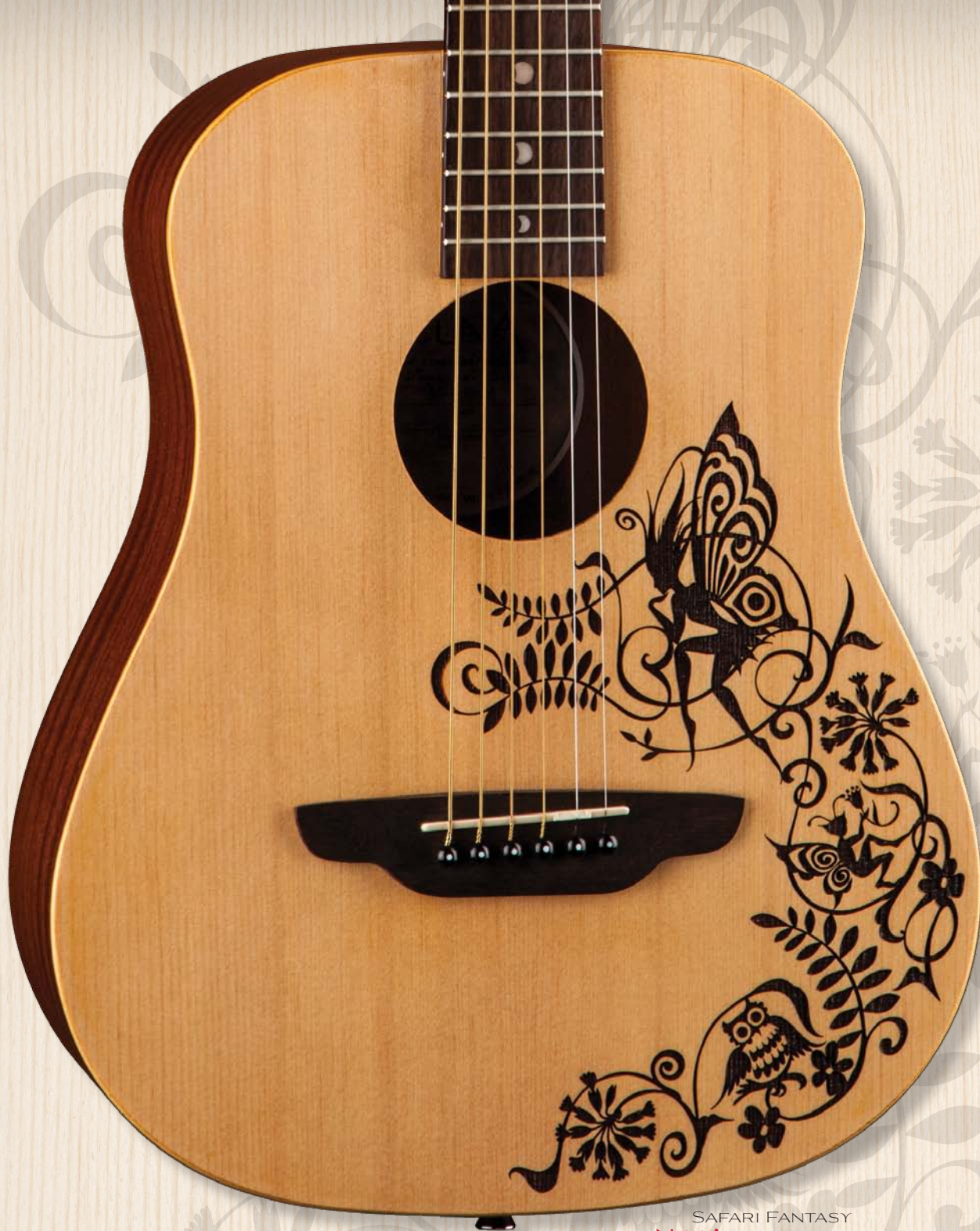
SAFARI FANTASY NEW!

"Be a lamp, or a lifeboat, or a ladder. Help someone's soul heal."