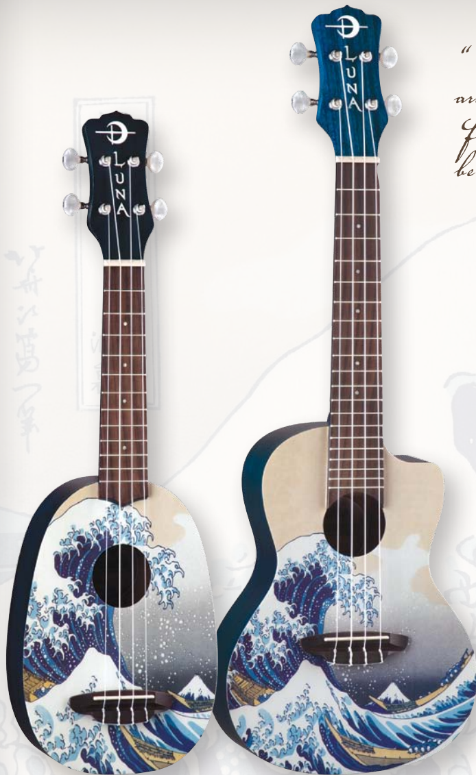
GREAT WAVE SOPRANO