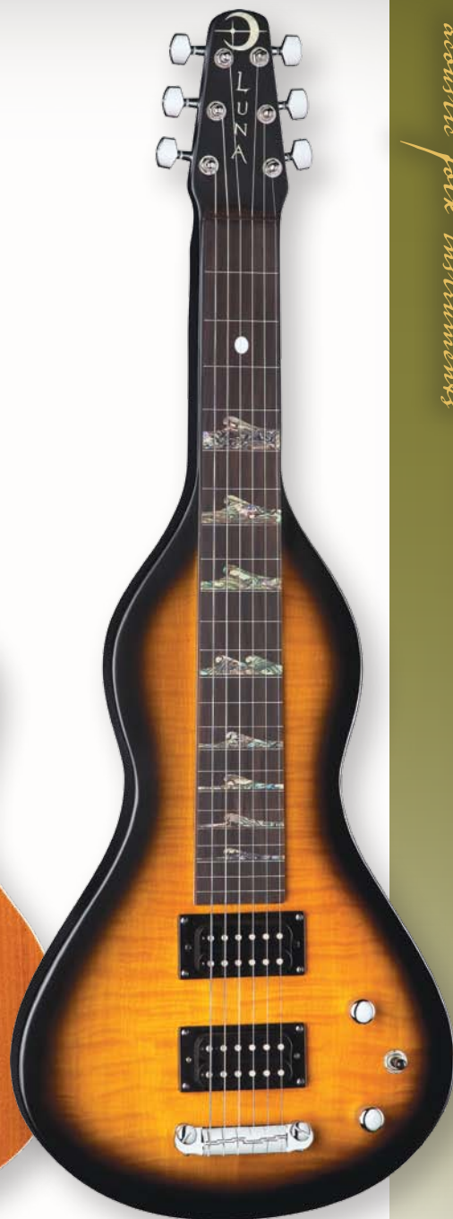
ELECTRIC LAP STEEL

"There is a fountain inside you. Don't walk around with an empty bucket."