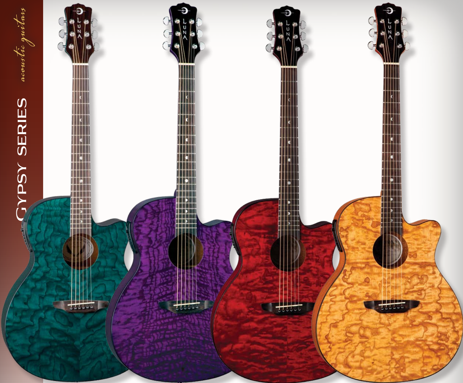
TEAL QA NEW!