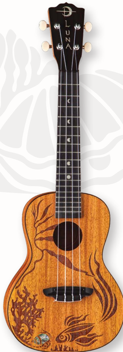
ALL SOLID MAHOGANY CORAL CONCERT

"Be melting snow. Wash yourself of yourself".