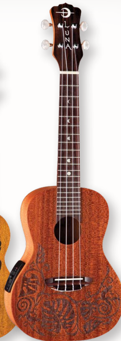
MO'O CONCERT PERFECT WITH OUR UKE SUITCASE AMP!

"Very little grows on jagged rock. Be ground. Be crumbled, so wildflowers will come up where you are."