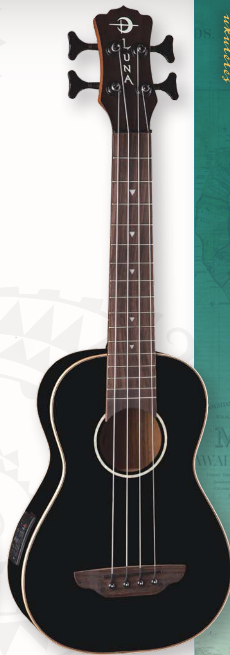
GLOSS BLACK UKE BASS

Luna's ukulele basses are fun to play - for portable performance or practice anywhere! They are 21" short scale instruments, featuring flatwound strings that are tuned to E-A-D-G like a traditional bass guitar - but one octave up.