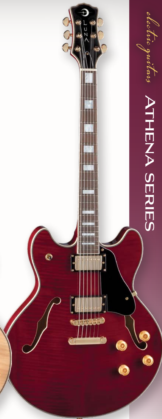
ATHENA 501 RED

"We can't help being thirsty, moving toward the voice of water."