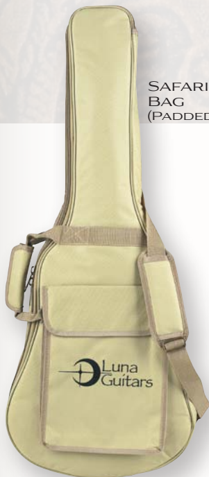
SAFARI TRAVEL BAG (PADDED GIG BAG)