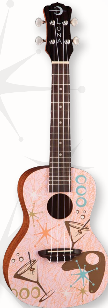
PINK MARTINI NEW!

"There is a morning inside you waiting to burst open into Light."