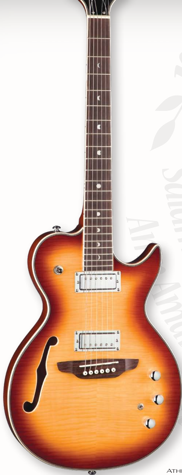
ATHENA HYBRID TOBACCO BURST FLAME