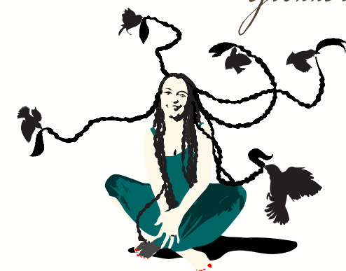
tribal elder, muse, and the creative vision behind Luna Guitars