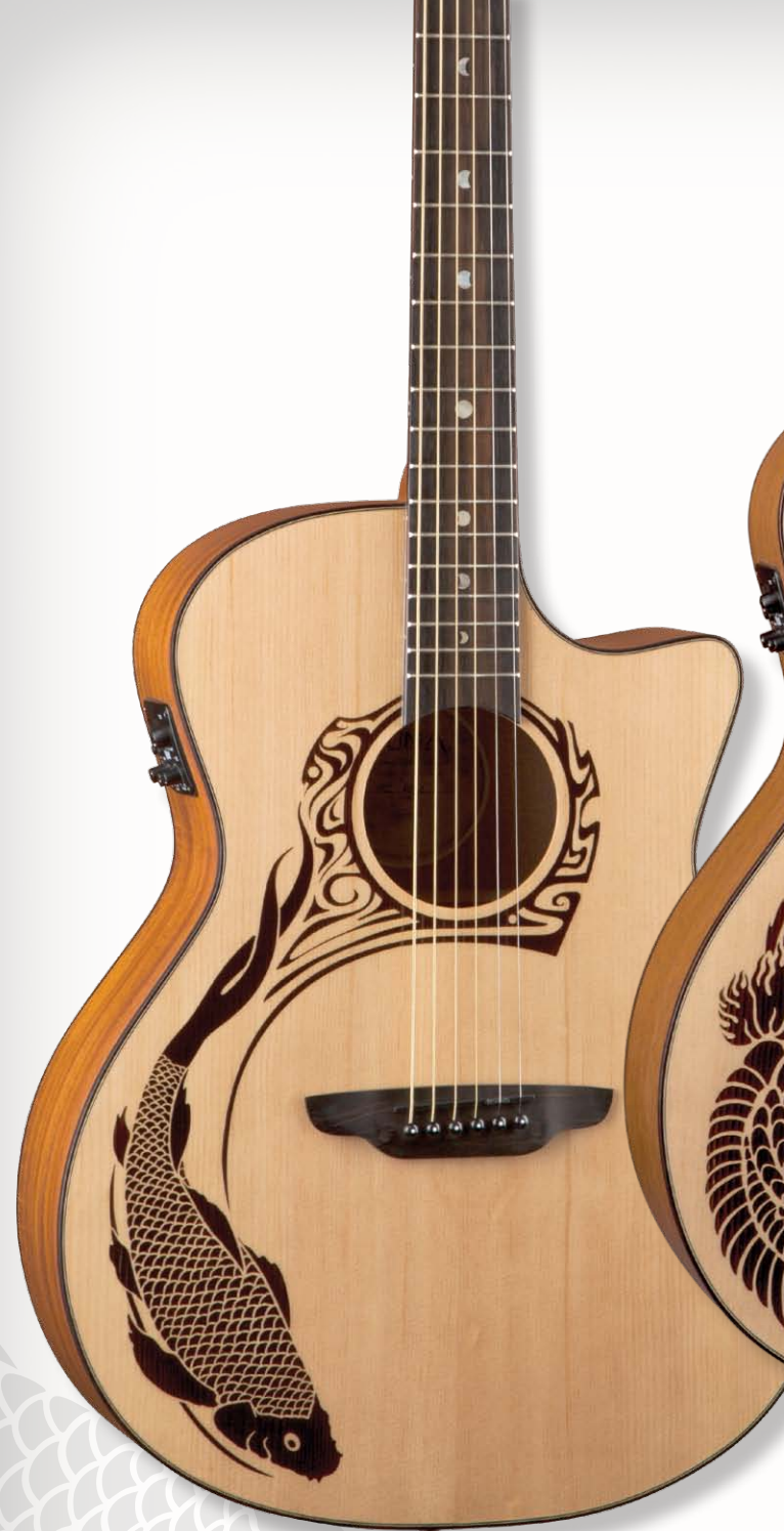
ORACLE KOI 2 (IMPROVED ROSETTE)