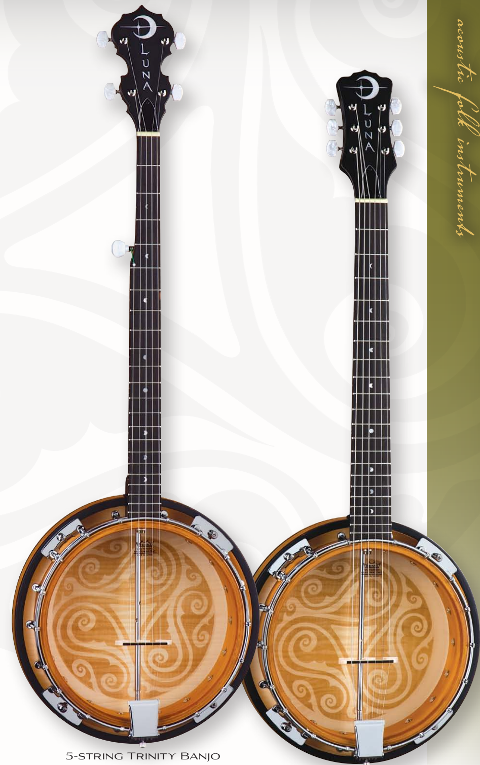
5-STRING TRINITY BANJO