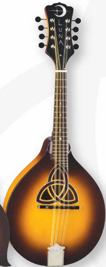
TRINITY A MANDOLIN

"Don't turn away. Keep your gaze on the bandaged place. That's where the light enters you."