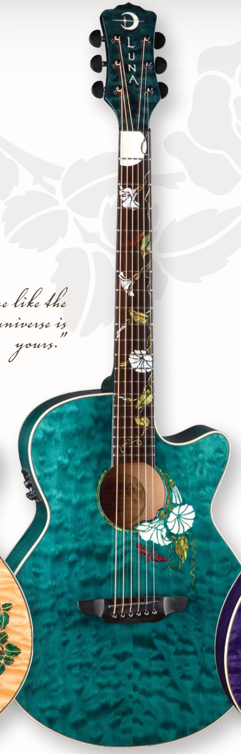
FLORA MOON FLOWER