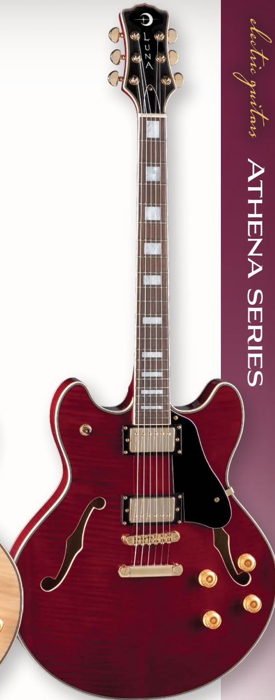
ATHENA 501 RED

"Everyone has been made for some particular work, and the desire for that work has been put in every heart."