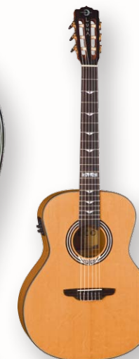
DECO NYLON Also available in a nylon string version