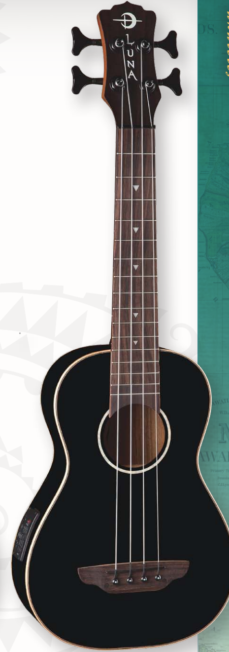
GLOSS BLACK UKE BASS

"And don't think the garden loses its ecstasy in winter. It's quiet, but the roots are down there riotous."