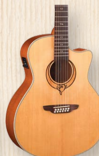
GRAND CONCERT TWELVE