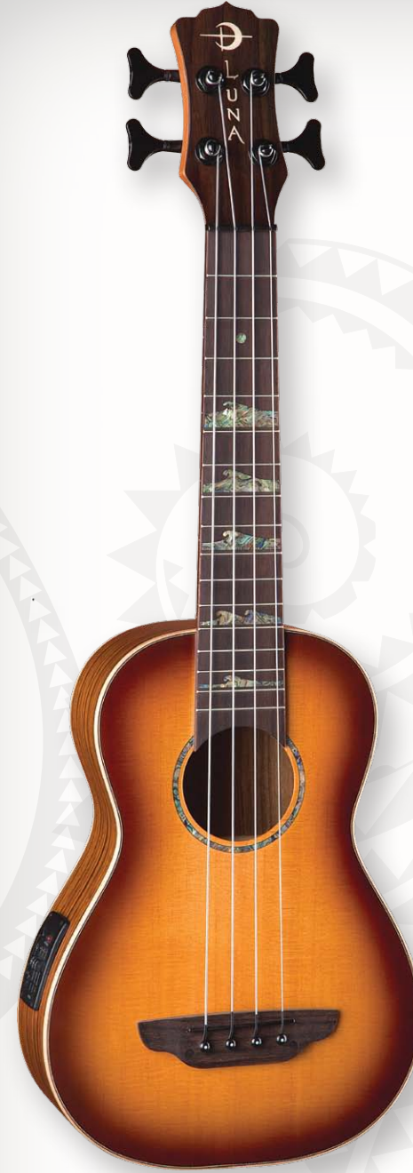
HIGH TIDE UKE BASS