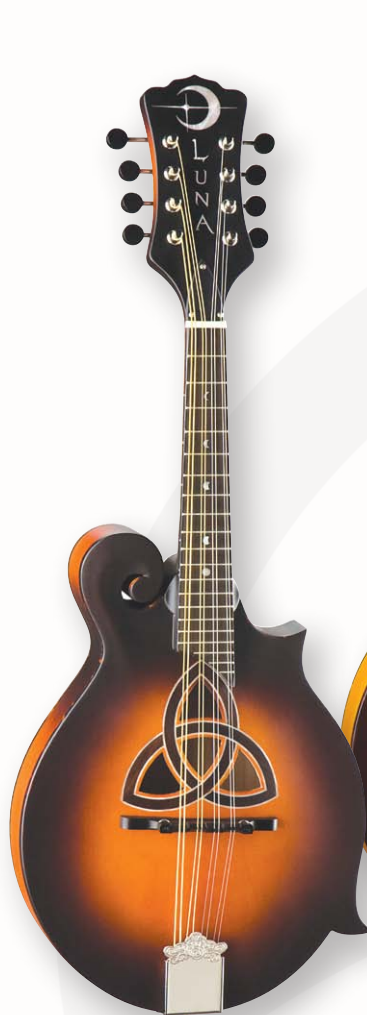
TRINITY F MANDOLIN