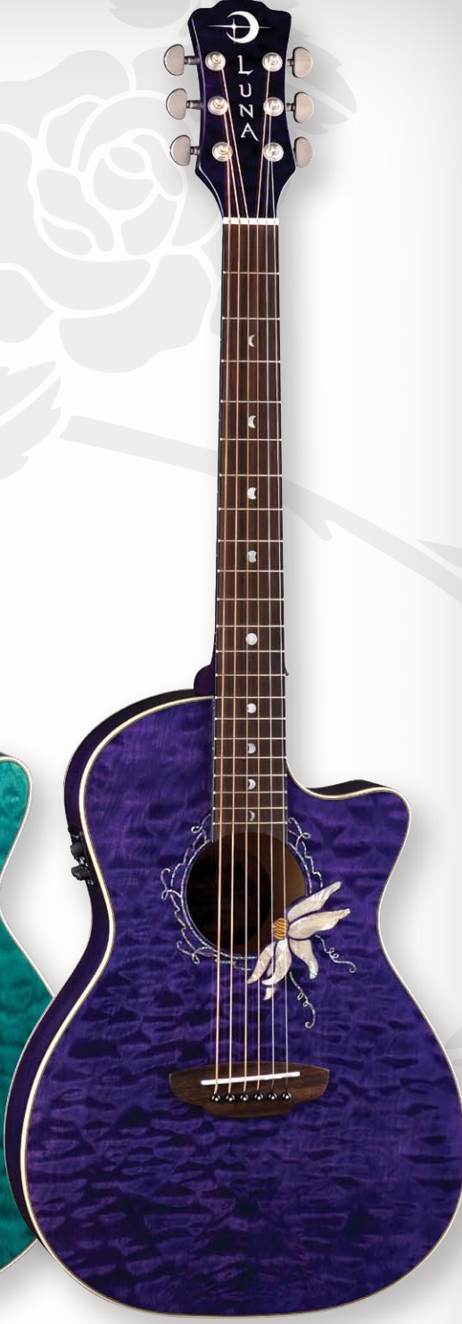
FLORA PASSION FLOWER