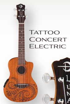
TATTOO CONCERT ELECTRIC