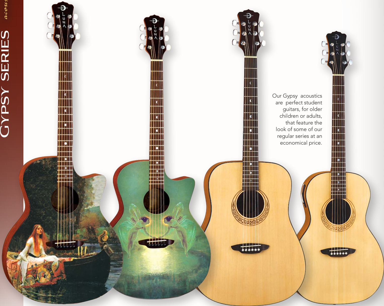
GYPSY FANTASIE "LADY OF SHALLOT"