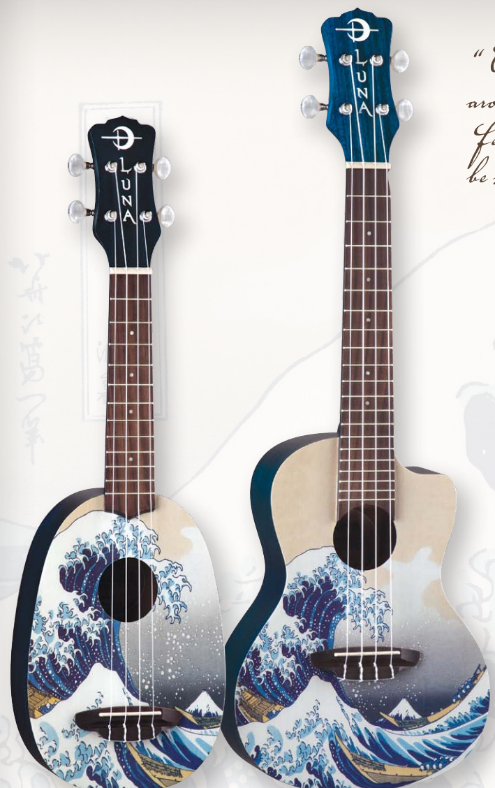
GREAT WAVE SOPRANO