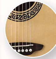
NATURAL ACOUSTIC AND NYLON