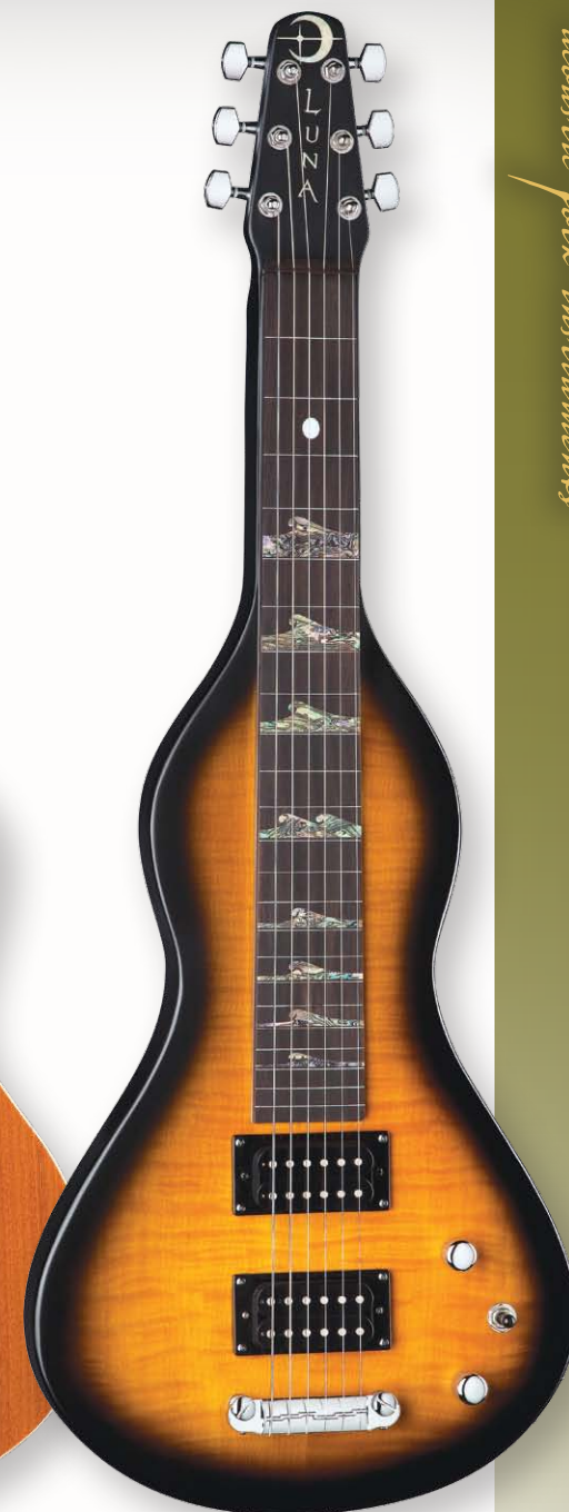
ELECTRIC LAP STEEL

"There is a fountain inside you. Don't walk around with an empty bucket."