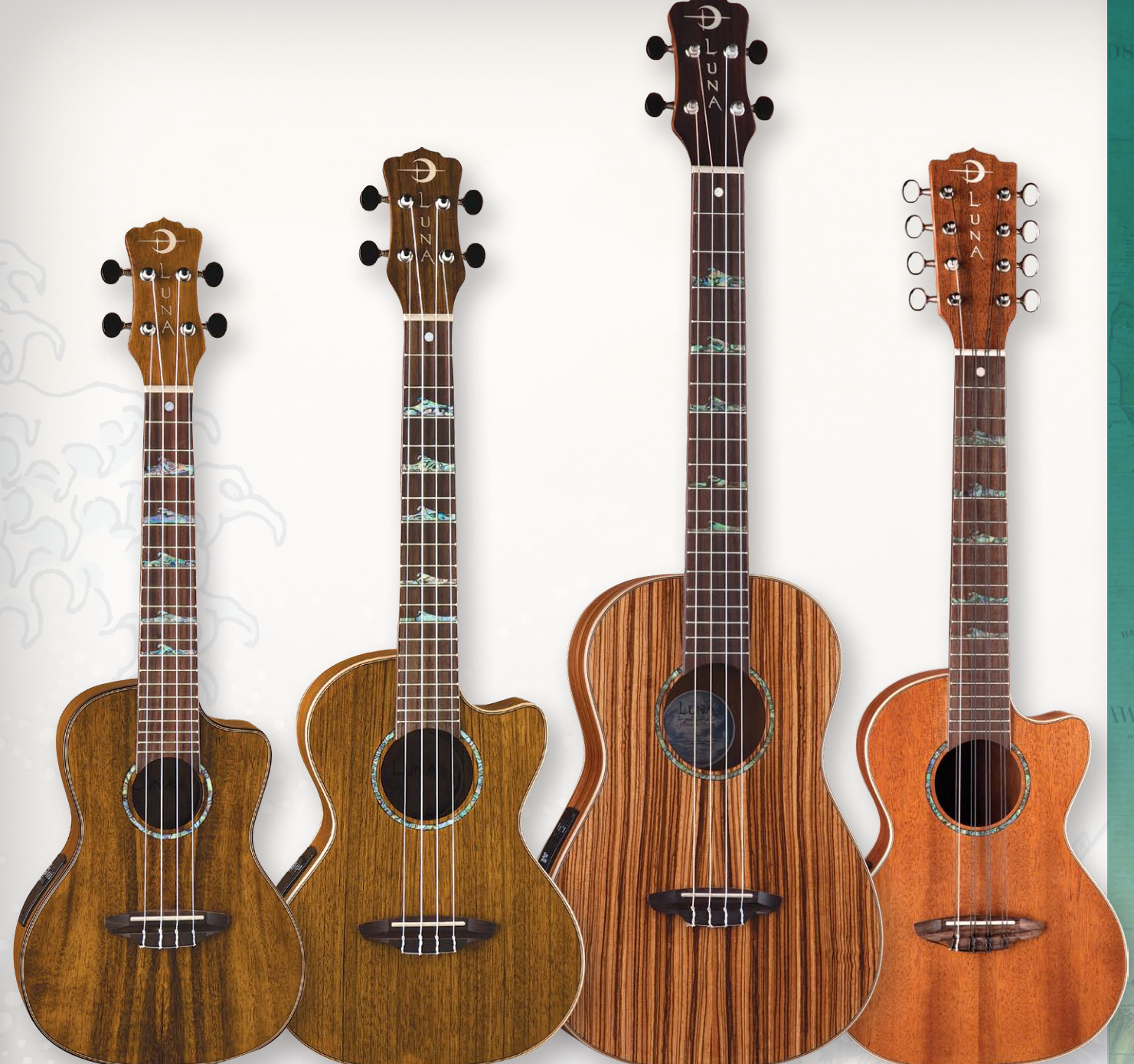
HIGH TIDE CONCERT KOA PERFECT WITH OUR UKE SUITCASE AMP!