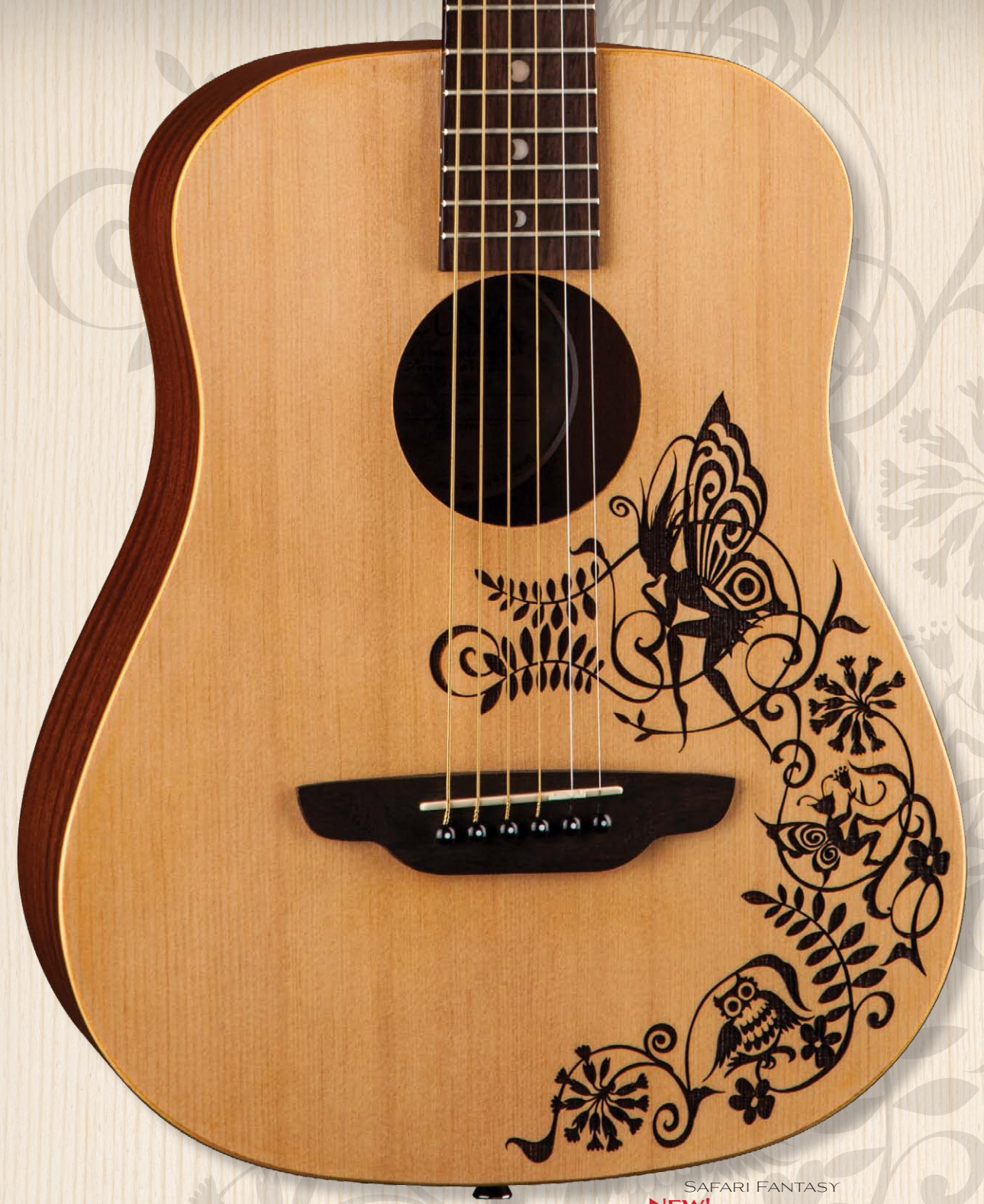
SAFARI FANTASY NEW!

"Be a lamp, or a lifeboat, or a ladder. Help someone's soul heal."