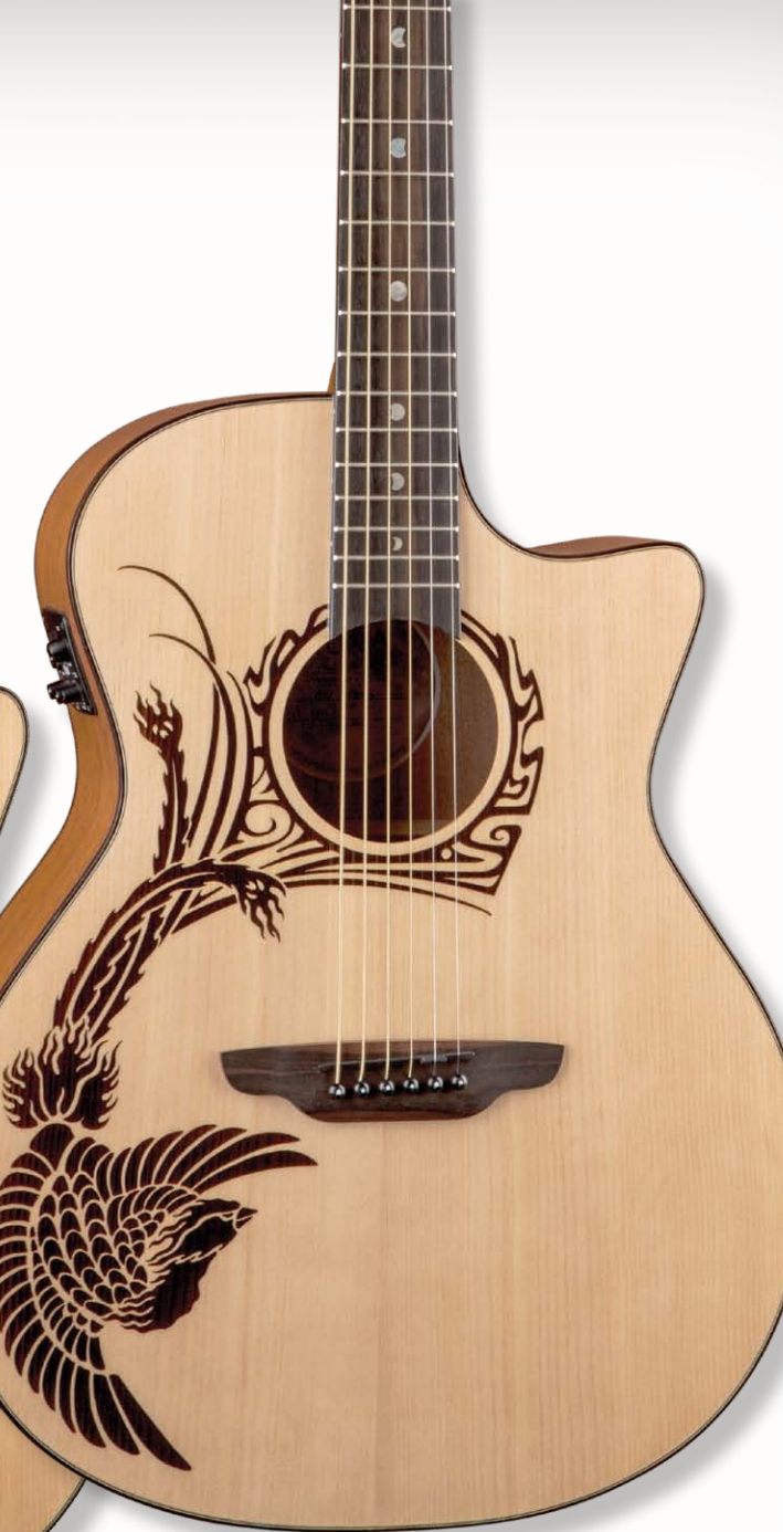
ORACLE PHOENIX 2 (IMPROVED ROSETTE)