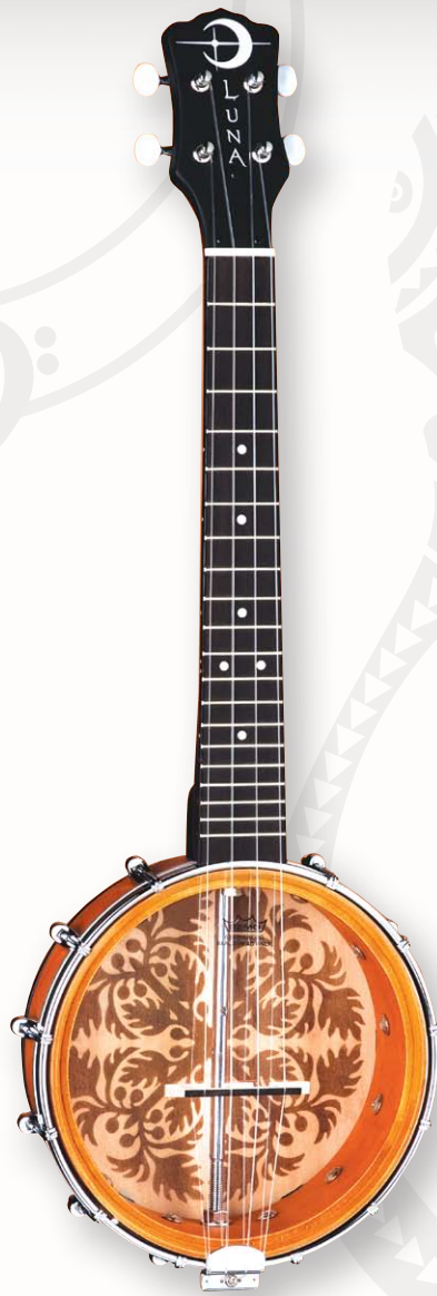
ULU 8" CONCERT BANJO UKE