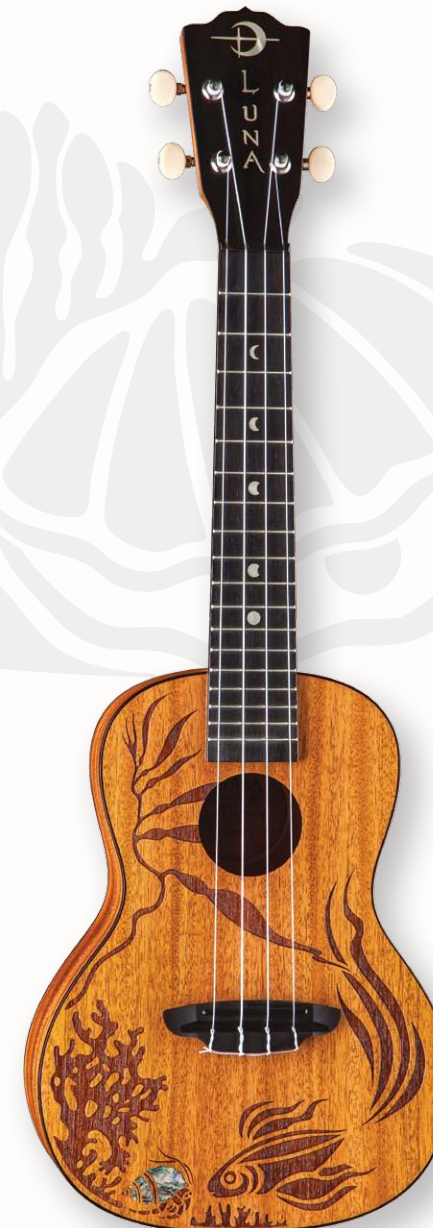
ALL SOLID MAHOGANY CORAL CONCERT

"Be melting snow. Wash yourself of yourself".