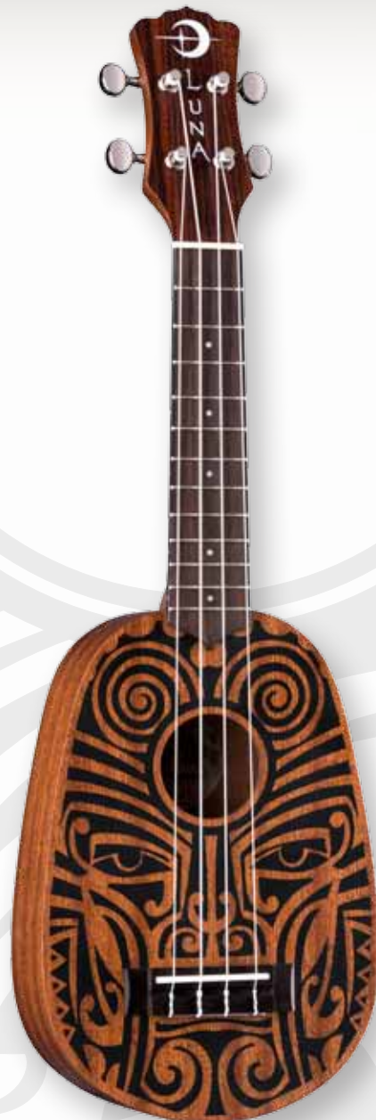
TRIBAL PINEAPPLE NEW!