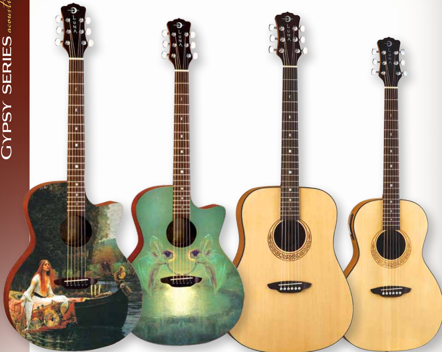
GYPSY FANTASIE "LADY OF SHALLOT"