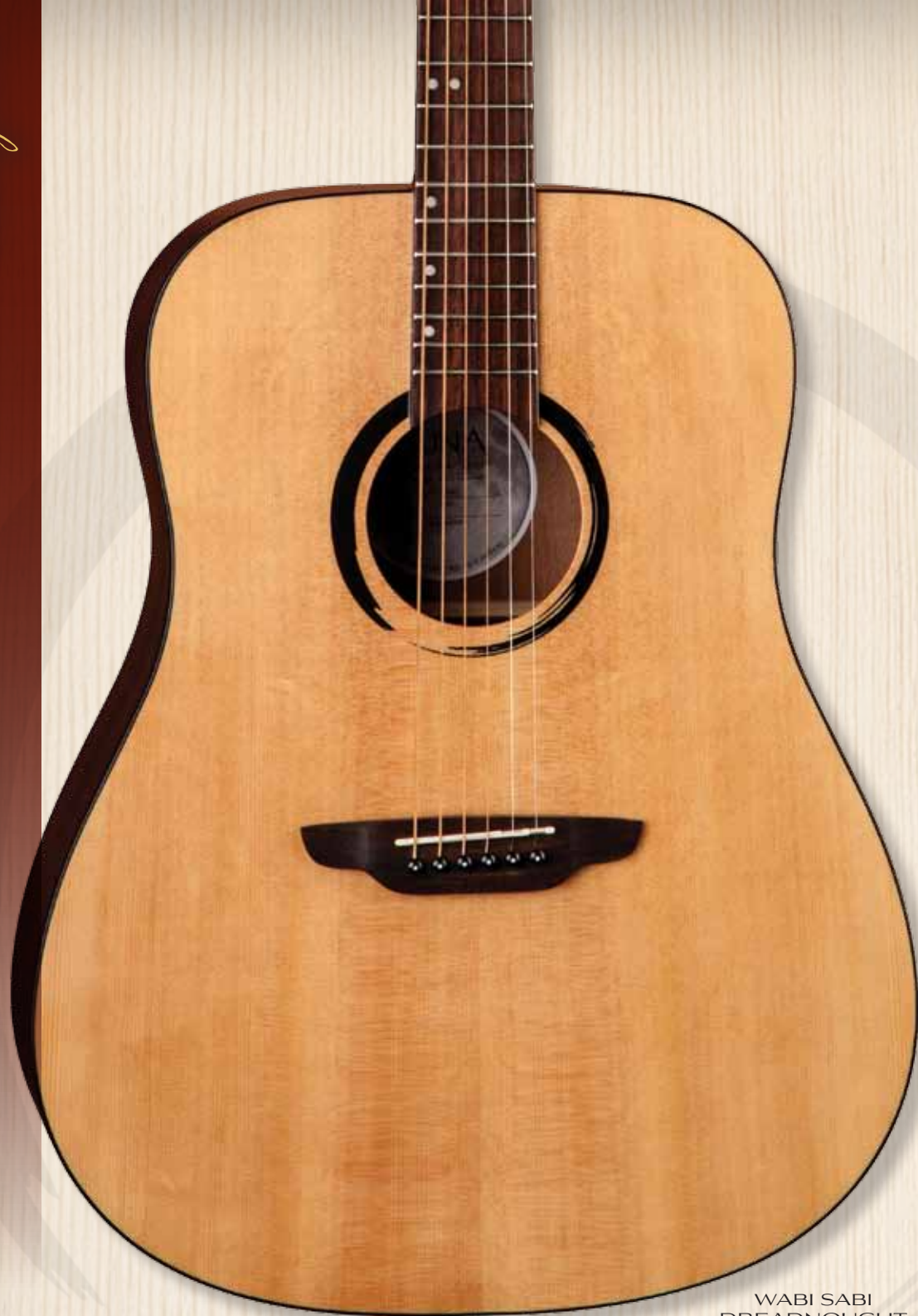
WABI SABI DREADNOUGHT