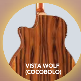
VISTA WOLF (COCOBOLO)