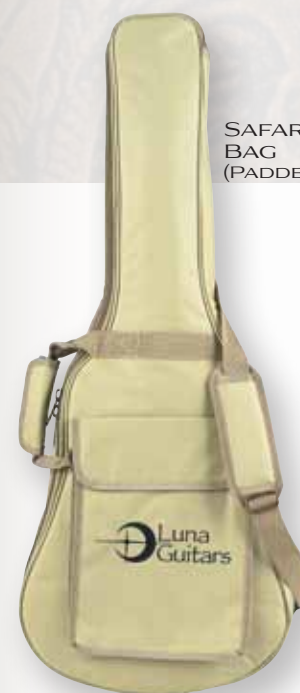
SAFARI TRAVEL BAG (PADDED GIG BAG)