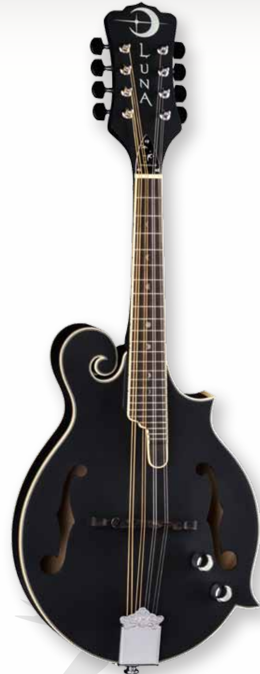
MOONBIRD F MANDOLIN W/ PIEZO NEW!