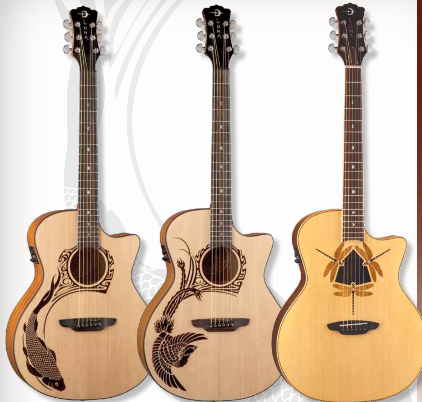
ORACLE KOI 2 (IMPROVED ROSETTE)