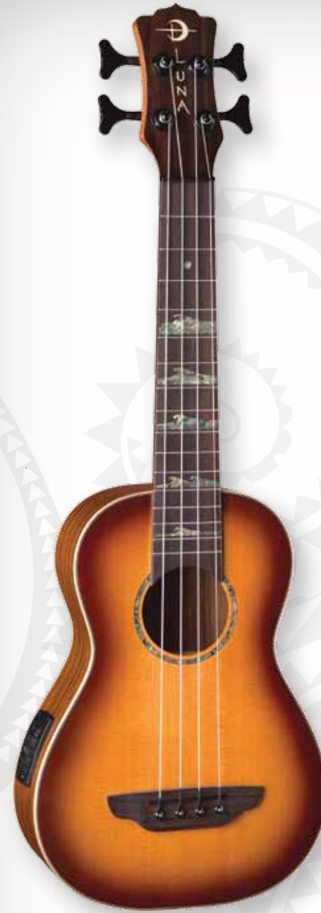
HIGH TIDE UKE BASS

A resonator ukulele is louder than a standard wooden ukulele, and has a different tone quality.