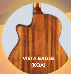
VISTA EAGLE (KOA)