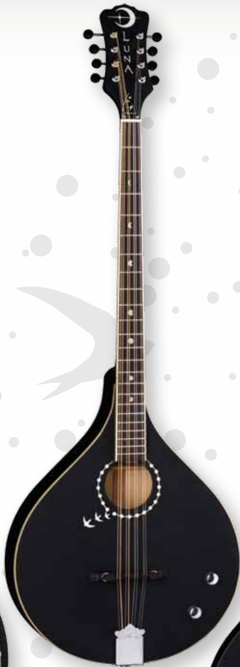
MOONBIRD BOUZOUKI W/ PIEZO NEW!