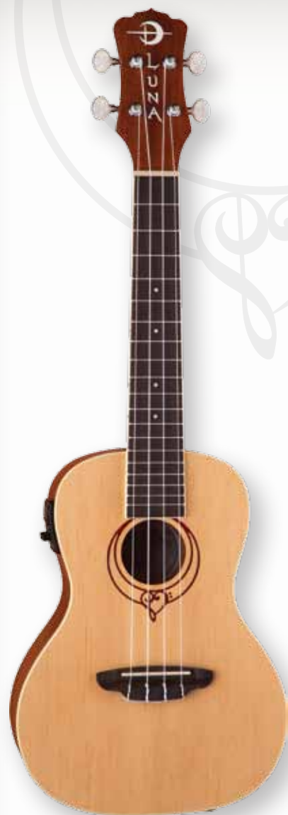
HEARTSONG UKE USB-EQUIPPED FOR RECORDING ON THE FLY!