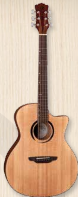
WABI SABI GC CUTAWAY