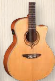
GRAND CONCERT TWELVE

"If you are irritated by every rub, how will your mirror be polished?"