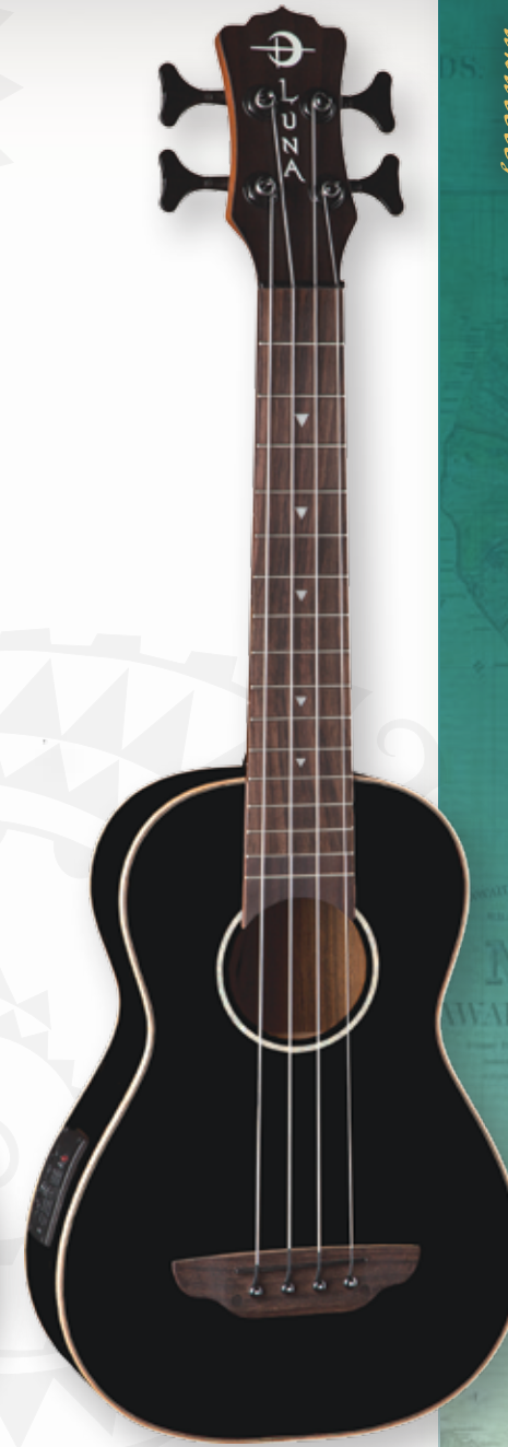
GLOSS BLACK UKE BASS

Luna's ukulele basses are fun to play - for portable performance or practice anywhere! They are 21" short scale instruments, featuring flatwound strings that are tuned to E-A-D-G like a traditional bass guitar - but one octave up.