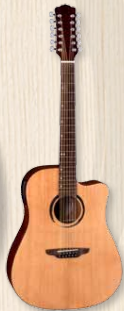
WABI SABI DC 12 STRING NEW!

"Wherever you are, and whatever you do, be in love."