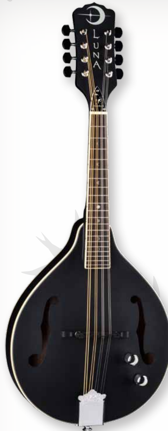
MOONBIRD A MANDOLIN W/ PIEZO NEW!