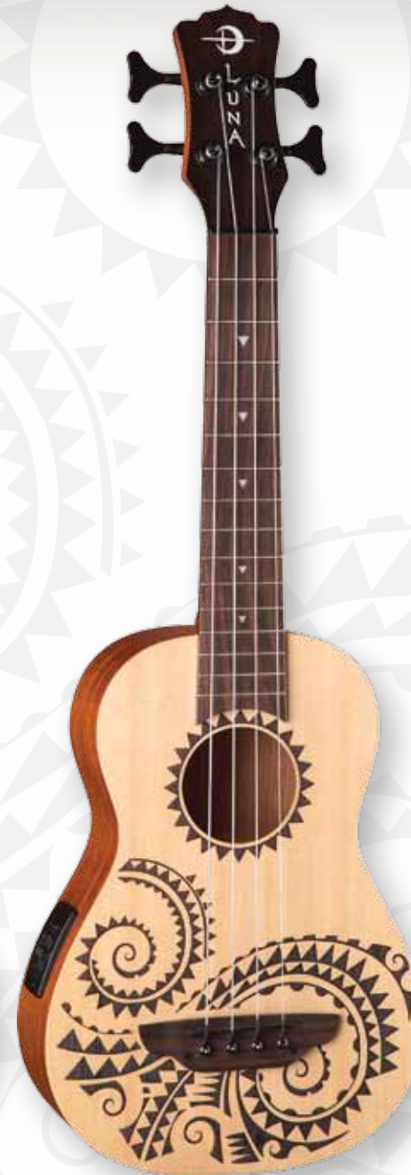
TATTOO UKE BASS