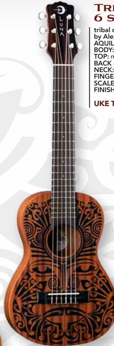
TRIBAL 6 STRING NEW!