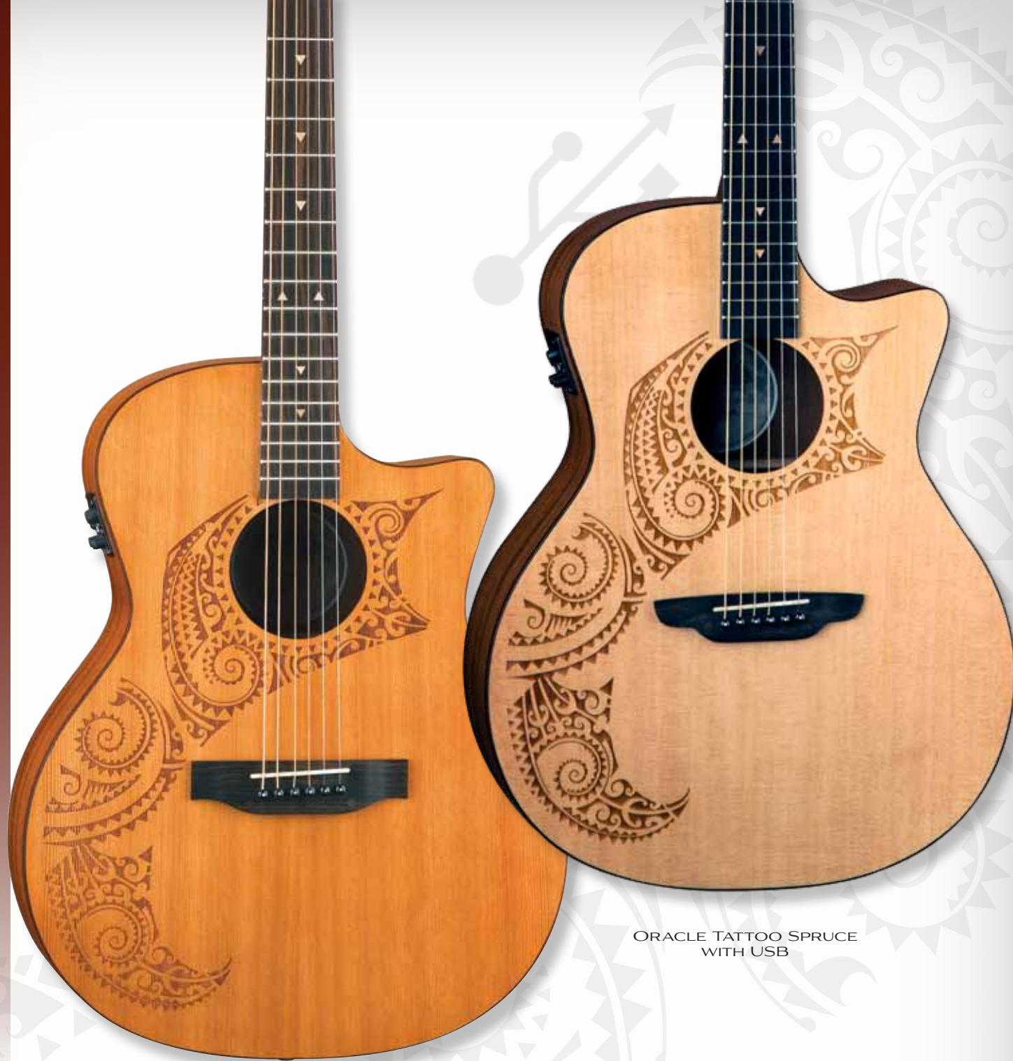
ORACLE TATTOO CEDAR