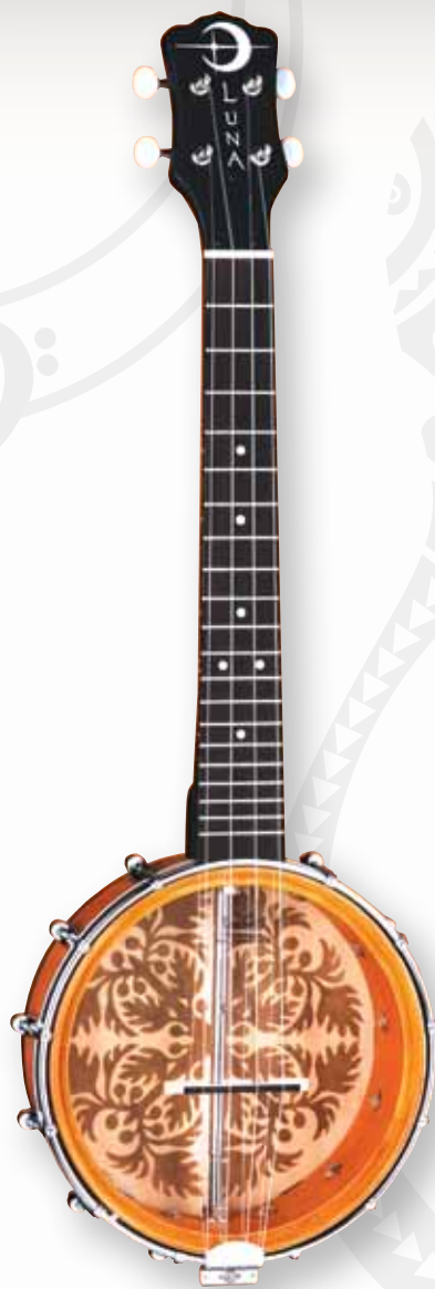
ULU 8" CONCERT BANJO UKE