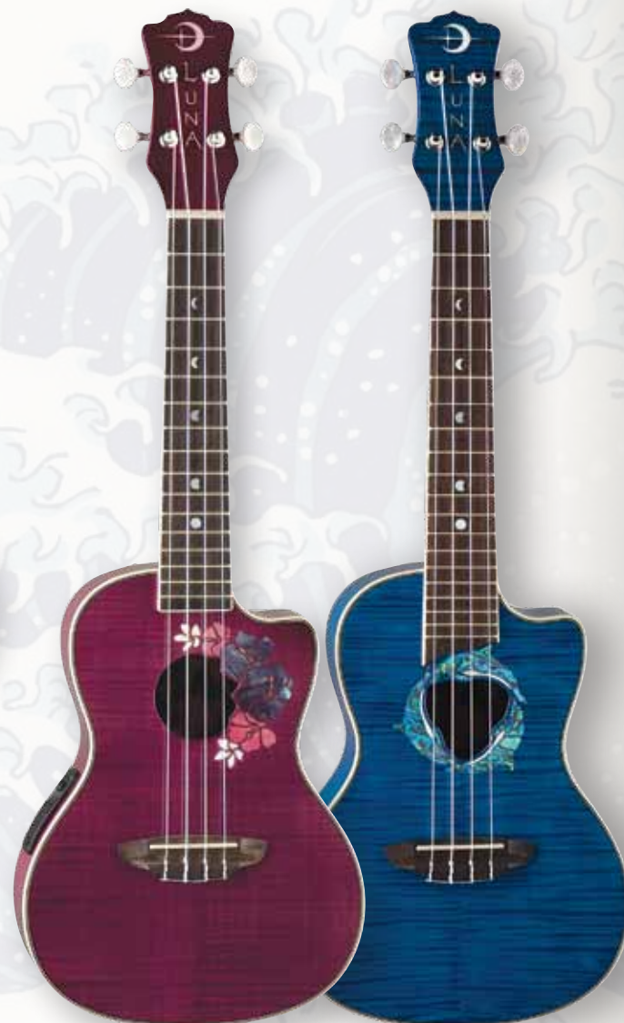
FLORAL CONCERT DOLPHIN CONCERT PERFECT WITH OUR UKE SUITCASE AMP!

"Observe the wonders as they occur around you. Don't claim them. Feel the artistry moving through and be silent."