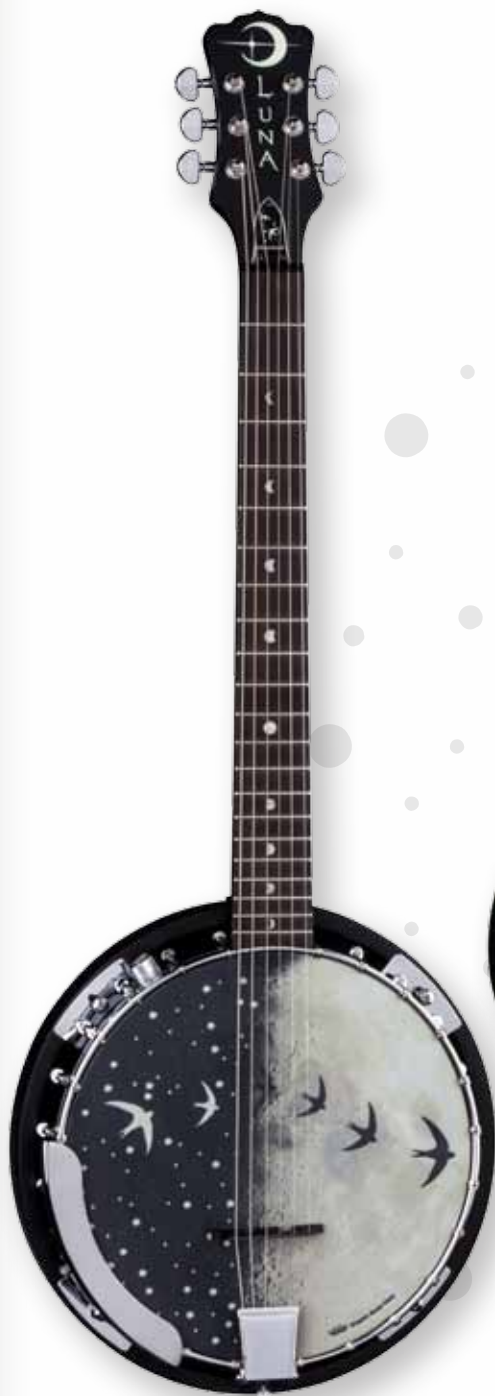
MOONBIRD 6-STRING BANJO NEW!