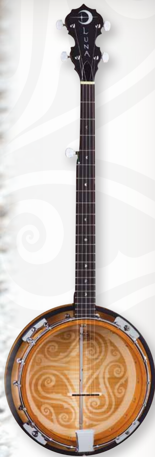
5-STRING TRINITY BANJO