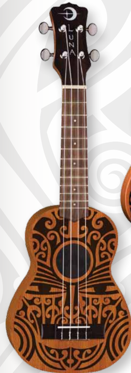
TRIBAL SOPRANO NEW!