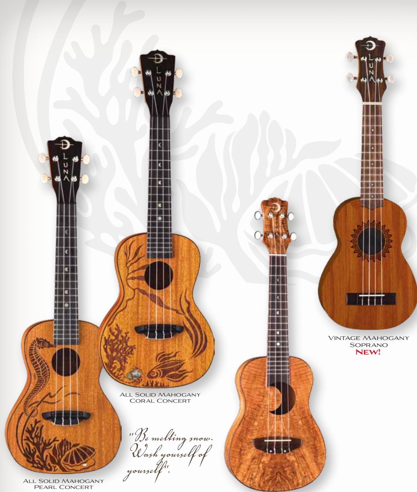
ALL SOLID MAHOGANY PEARL CONCERT