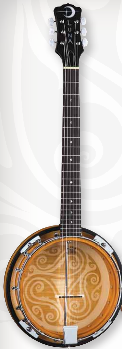
6-STRING TRINITY BANJO

Luna's banjos feature the same exquisite detailing as our other instruments. The back of the mahogany resonator makes a perfect canvas for the Celtic-inspired "Trinity" laser etched design, over a beautiful tobacco burst with faux tortoise shell binding – making these instruments truly unique.