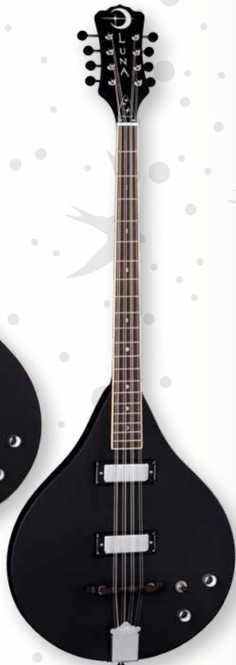
MOONBIRD SOLID BODY BOUZOUKI ELECTRIC NEW!