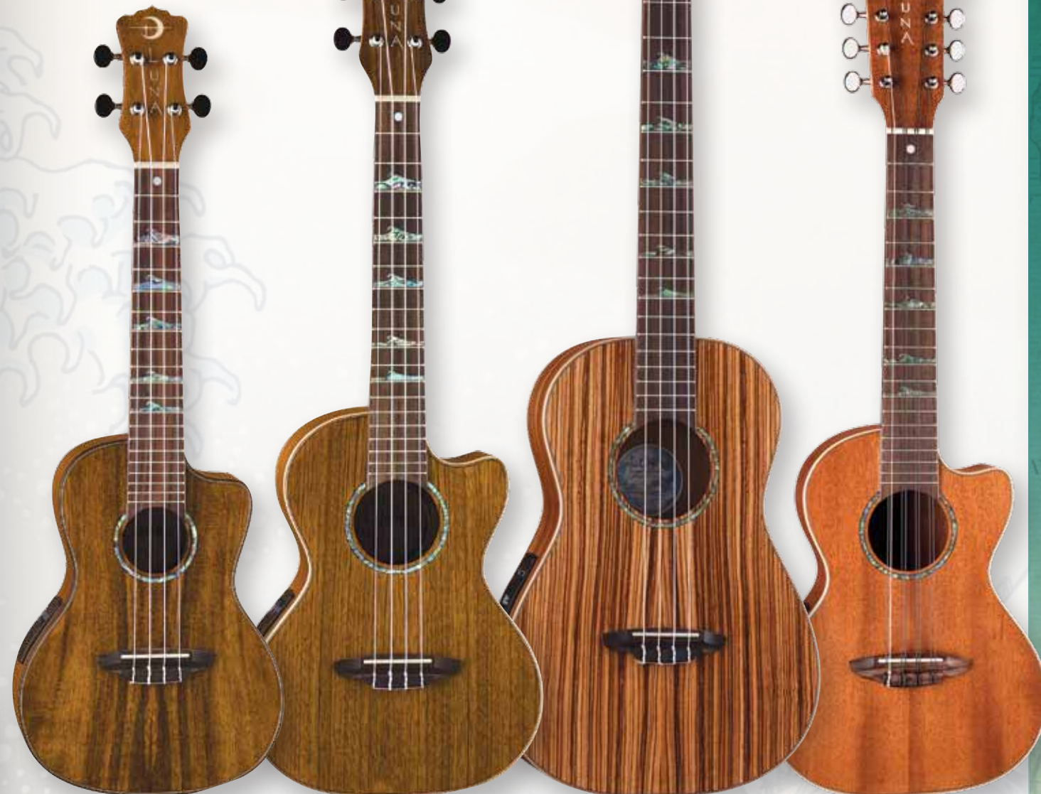
HIGH TIDE CONCERT KOA HIGH TIDE TENOR OVANGKOL HIGH TIDE BARITONE ZEBRA HIGH TIDE TENOR 8-STRING MAHOGANY PERFECT WITH OUR UKE SUITCASE AMP! PERFECT WITH OUR UKE SUITCASE AMP! PERFECT WITH OUR UKE SUITCASE AMP! PERFECT WITH OUR UKE SUITCASE AMP!

"If Light is in your heart you will find your way home."