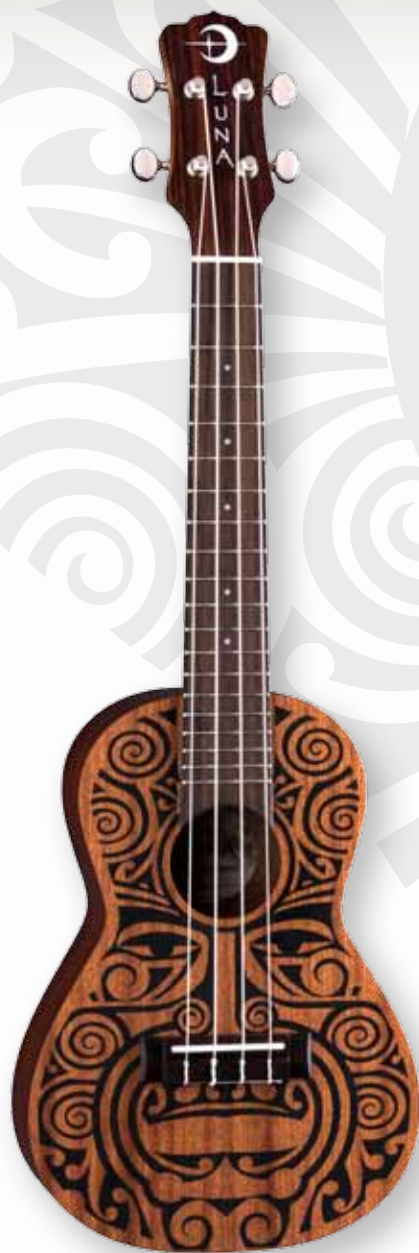
TRIBAL CONCERT NEW!