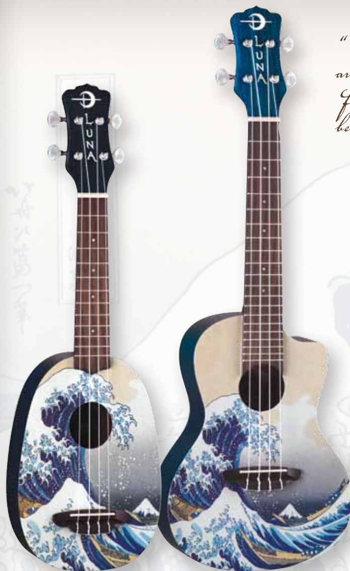
GREAT WAVE SOPRANO