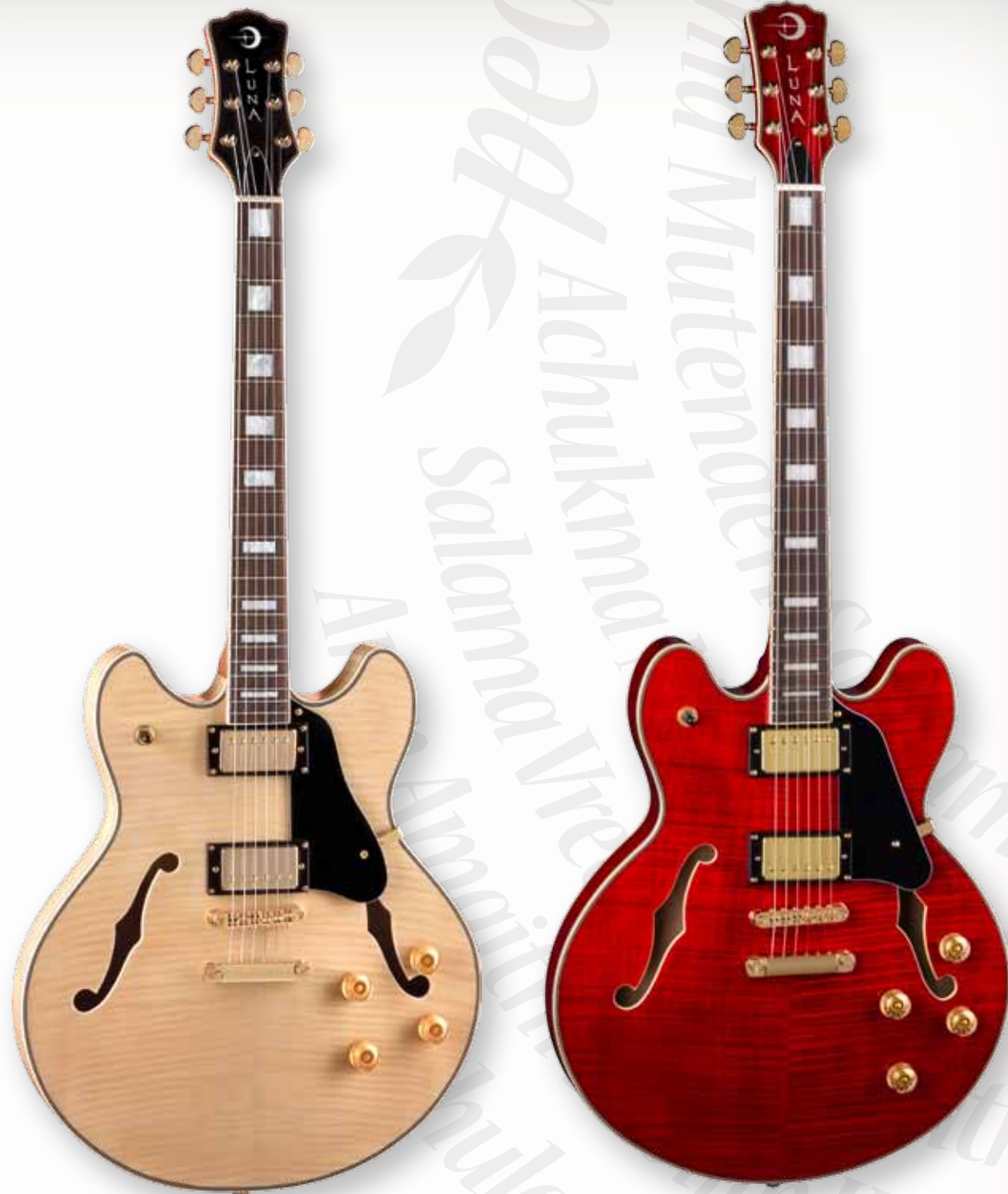
ATHENA 501 NATURAL